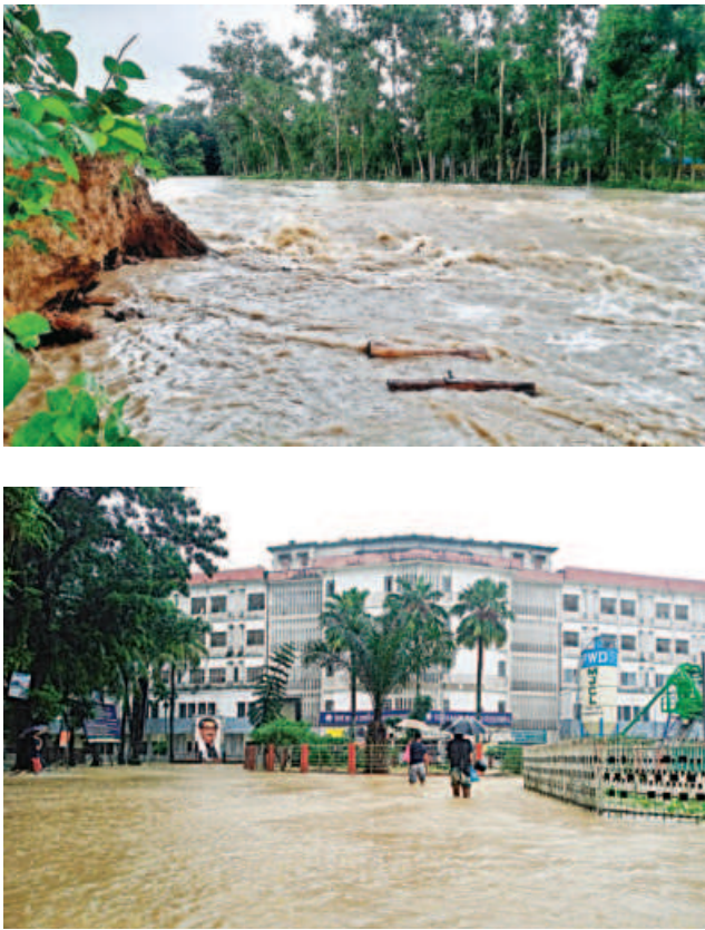
A woman with two children wade through water as they look for shelter amidst heavy rains that caused widespread flooding in Sylhet yesterday. Water, top left , gushing into Bangladesh at Akhaura from India. Sylhet's MAG Osmani Medical College Hospital, bottom left , inundated. Satellite images, right, taken in March and June show the water extent of Sylhet division.