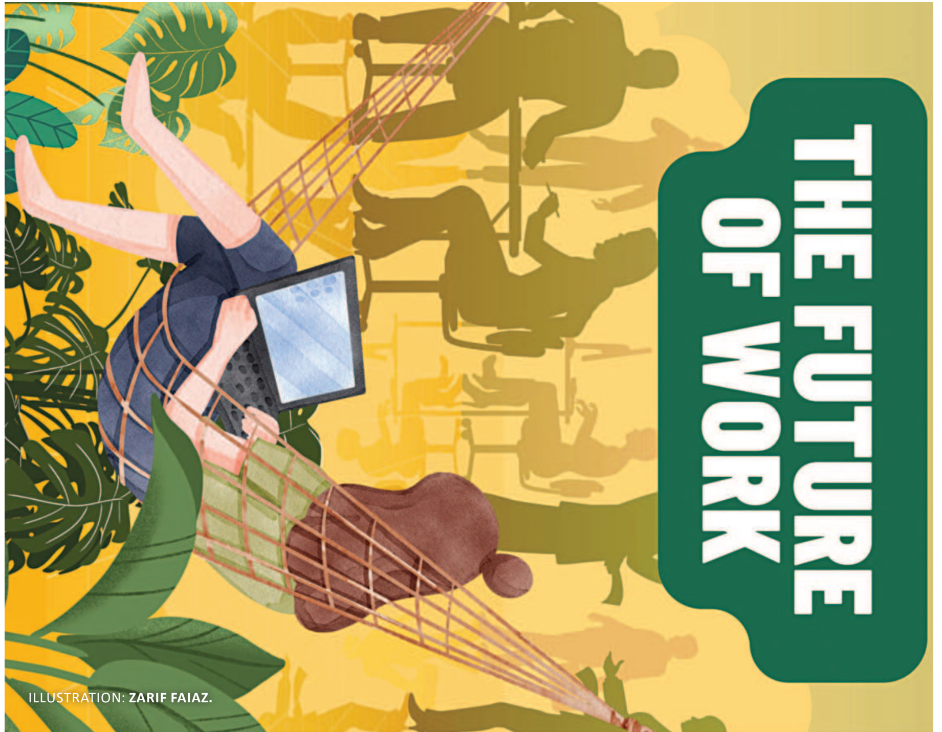
ILLUSTRATION: ZARIF FAIAZ.