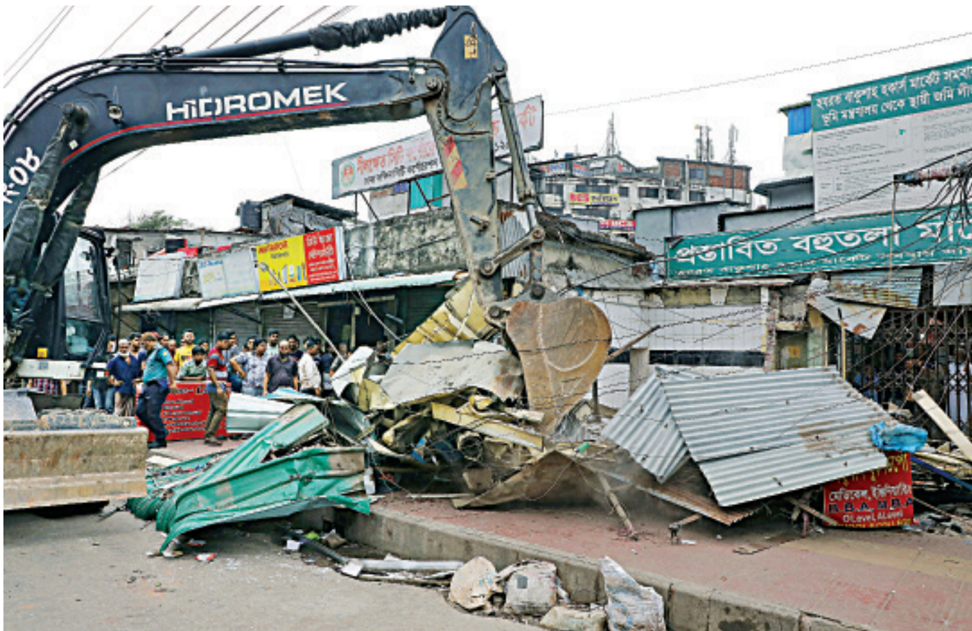
An excavator knocking down illegal structures near Baku Shah Hawkers' Market in the capital's Nilkhet area yesterday. The Dhaka South City Corporation conducted the drive to free the area of illegal occupiers.