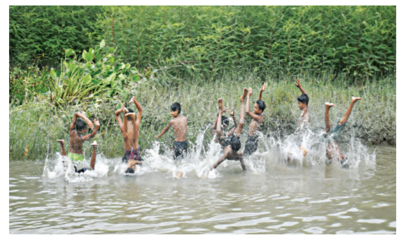
YOUTHFUL SPIRITS... To beat the summer heat, these young boys decided to take a dip in a canal in Barishal's Taltoli area yesterday. Soon, this activity turned into a friendly competition of who can dive into the waterbody in a more acrobatic way.

The deer came to the locality from Rema-Kalenga sanctuary. As some people tried to catch it, it ran away and fell in a pond of a local mosque.