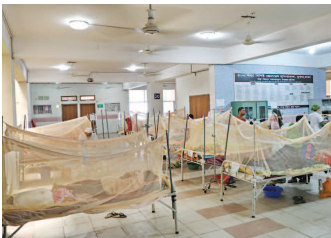
As soon as the monsoon starts, the number of dengue patients goes up at city hospitals. Recently, healthcare facilities are reporting an increase of such cases. The photo was taken at a ward in Mugda General Hospital yesterday.