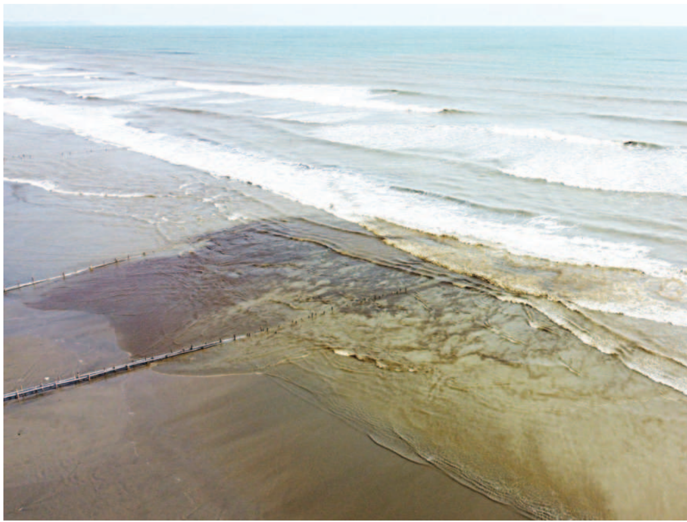
Wastes from shrimp hatcheries polluting the sea in Cox's Bazar, harming nature, and ruining the experience of tourists at the beach. The photo was taken recently.