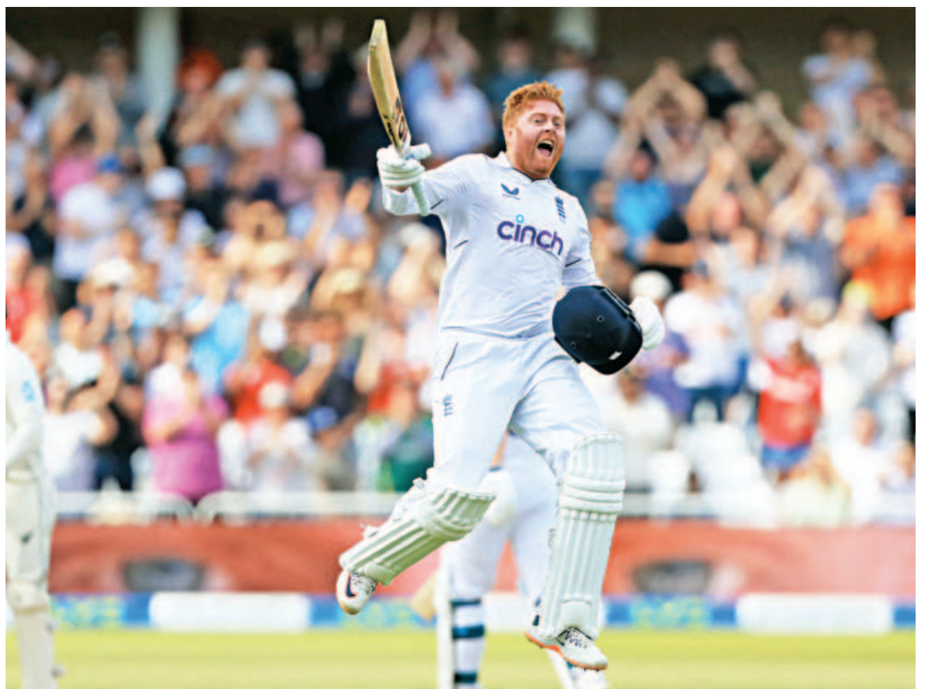
England batter Jonny Bairstow jumps for joy after reaching a 77-ball century on the fifth day of the second Test against New Zealand at Trent Bridge in Nottingham on Tuesday. The right-hander was eventually dismissed for a 92-ball 136, but his effort helped the home side to a five-wicket win and an unassailable 2-0 lead in the series.