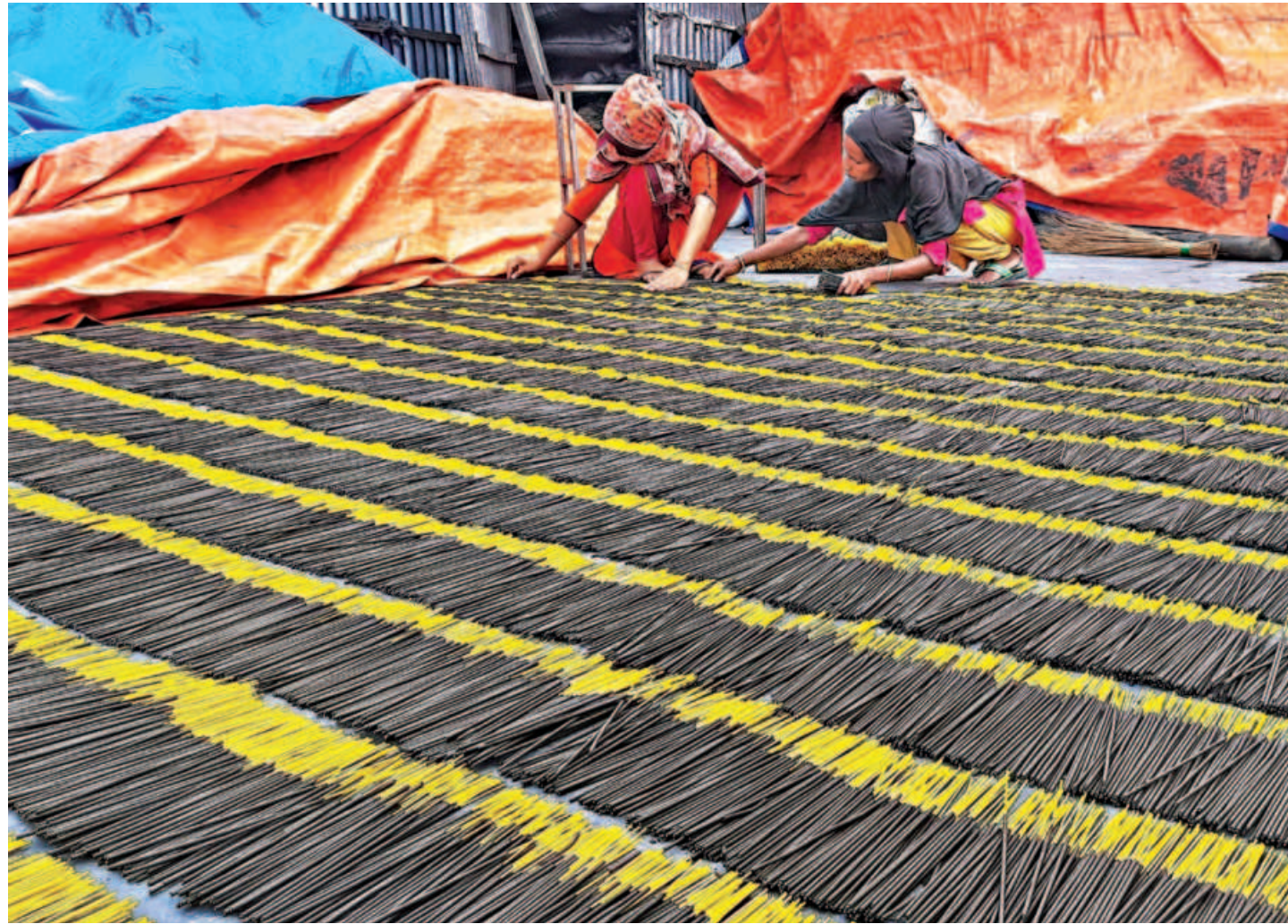
Women lay out files of incense sticks, made out of charcoal powder and perfume, to let them dry. For this task, these workers get paid Tk 200 per day. This picture was taken from Khulna's Zero Point area yesterday.

"Both sides agreed to work on addressing verification related problems and holding regular meetings of the Joint Working Group (JWG) and Technical Working Group for early commencement of repatriation," according to a statement of the foreign ministry.