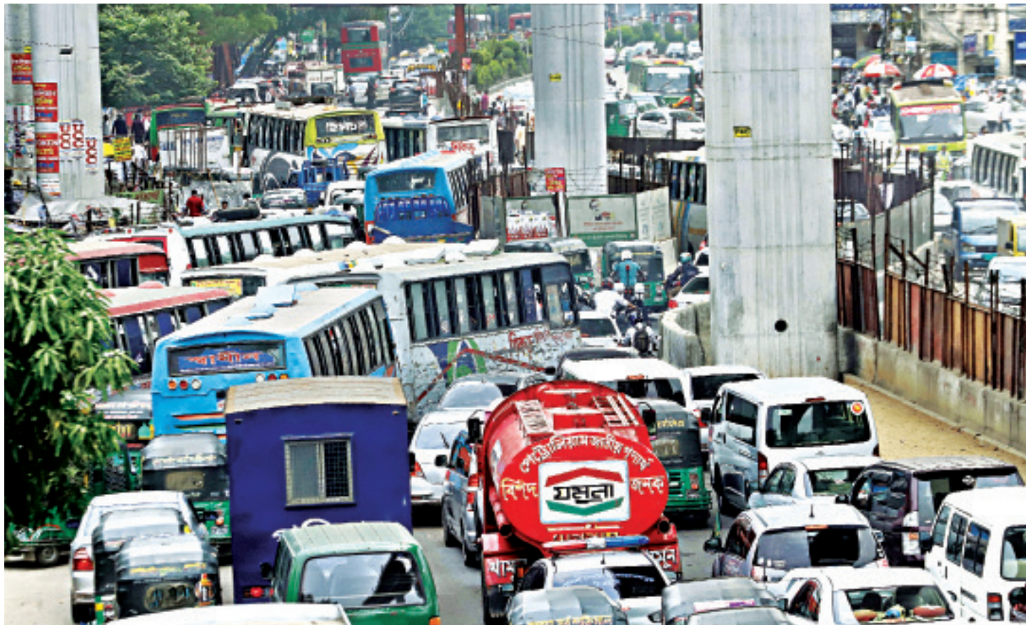
Standstill traffic on both sides of the Kazi Nazrul Islam Avenue at Farmgate yesterday. Traffic has become horrendous in the capital. The prime minister yesterday asked officials concerned to take effective steps to ease congestion.