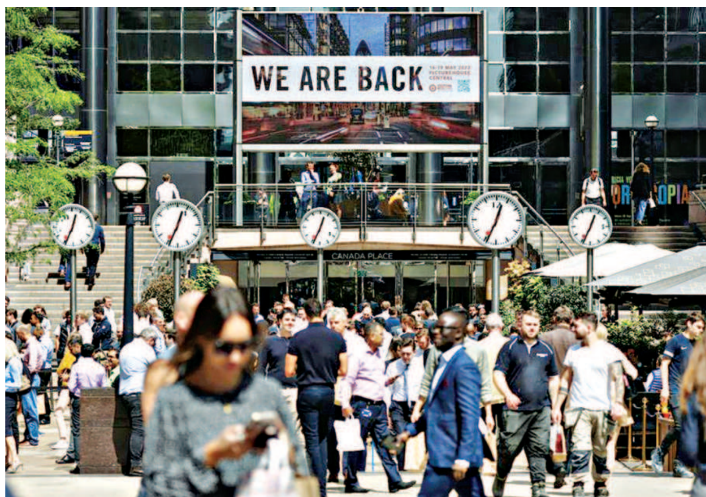
People walk through the financial district of Canary Wharf as it was announced that British consumer price inflation hit an annual rate of 9 per cent in April, in London on May 18.