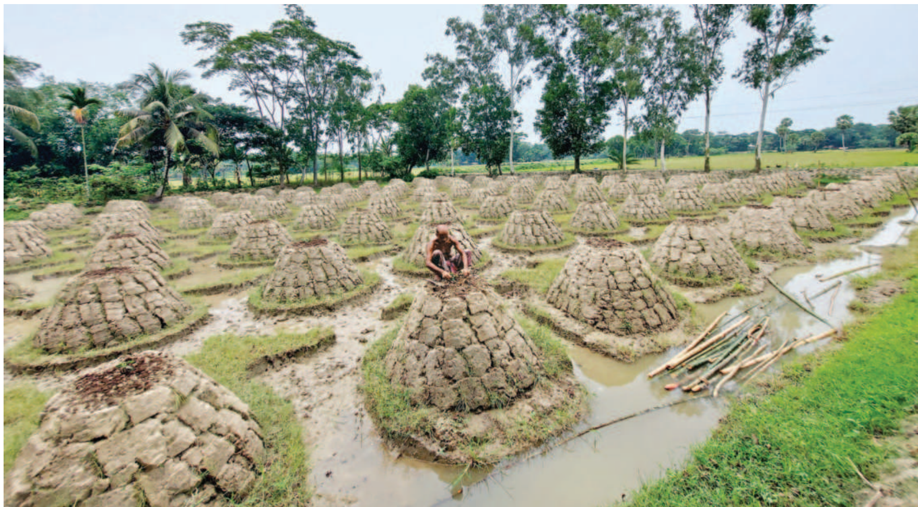
Mounds of earth erected to grow bottle gourd on top, effectively keeping the roots safe from inundation on the low-lying land during the rainy season. Bangladesh Agricultural Research Institute's regional office has been advising farmers to adopt the practice for growing vegetable seedbeds to increase food production. The photo was taken at Chauaripara village of Banaripara upazila in the southern coastal district of Barishal last week.