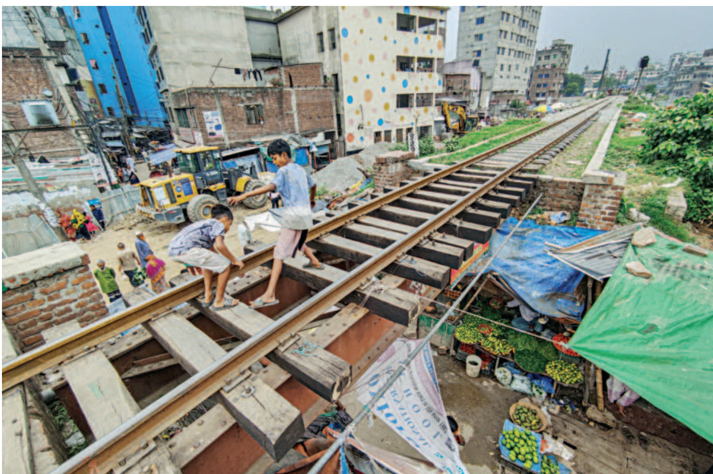
Two children play on a rail bridge over a road in Koratitola in the capital yesterday. If they see an approaching train late, they would not be able to move to the side. They also risk falling to the ground through the gaping openings between the sleepers. Children left to their own devices are often seen on Dhaka streets.