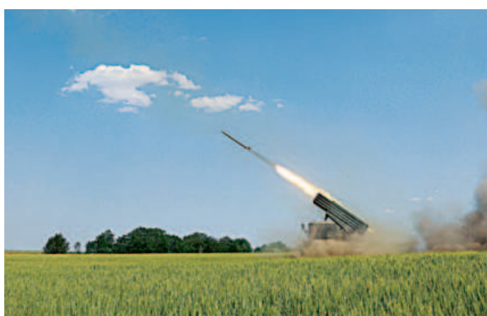
A view of the damage to the Nika Tera grain terminal, as Russia's attacks on Ukraine continues, in Mykolaiv yesterday. Left, Ukrainian artillerymen fire a BM-21 Grad multiple rocket launcher near Izyum, south of Kharkiv. The war is already taking a dramatic toll on the world economy and placing a huge swath of the world's population, especially those in developing nations, at an increased risk of harm, the United Nations warned.