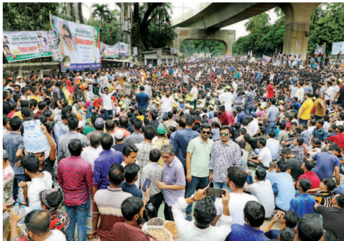
Demanding release of party chairperson Khaleda Zia and allowing her to go abroad for better treatment, BNP held a rally in front of Jatiya Press Club yesterday. The north and south city units of the party organised the event.