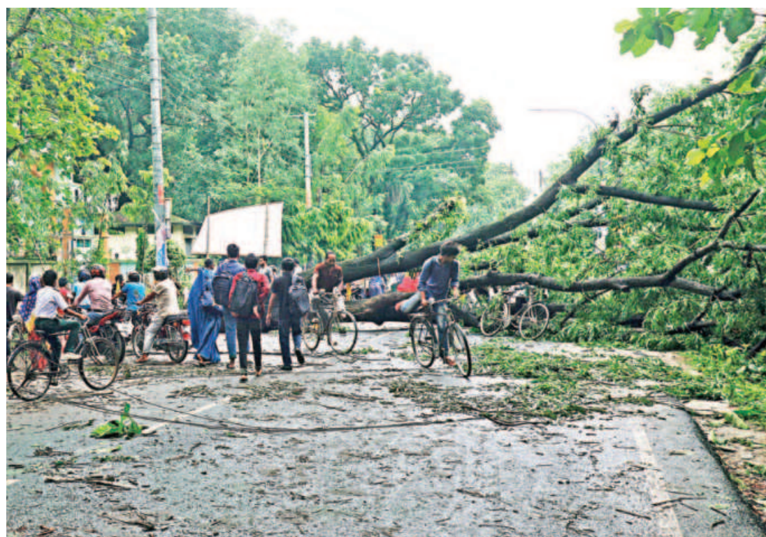
Traffic movement was halted for hours in Dinajpur town yesterday as storm uprooted a giant roadside tree around 4:30am. It wasn't until three in the afternoon that the tree was removed, allowing vehicles to resume movement. This photo was taken in front of Dinajpur Government College.