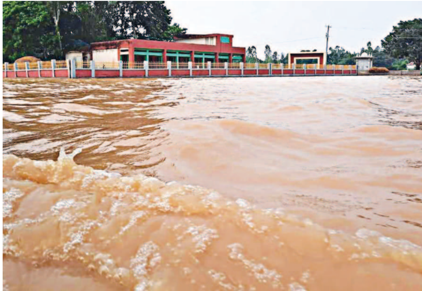
The residents of Kurigram's Rowmari upazila have been going through an extremely challenging time as reddish water flowing from Assam, India have flooded 30 villages across three unions. Roads are inaccessible, crops are submerged and in the face of such difficulty, many residents have moved to safer regions with all their belongings.