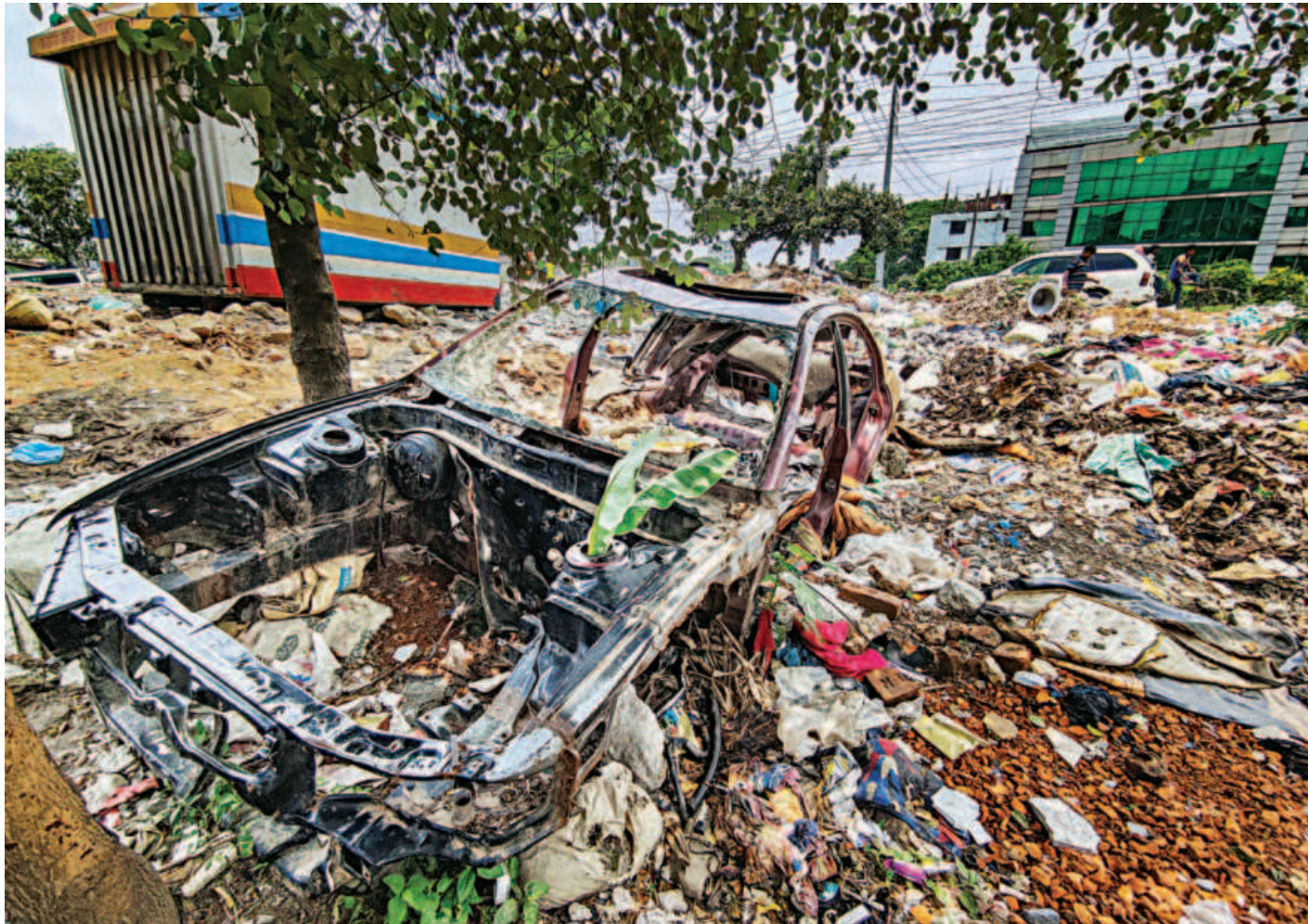
With no surveillance on the part of the authorities, this open space beside the main road in Hazaribagh Beribadh area has been turned into a garbage dump. One can find almost all types of waste here, even unusual ones like this sweatshop car, which was meant for repairs, but now grows rust amidst the polluted area. This photo was taken yesterday.