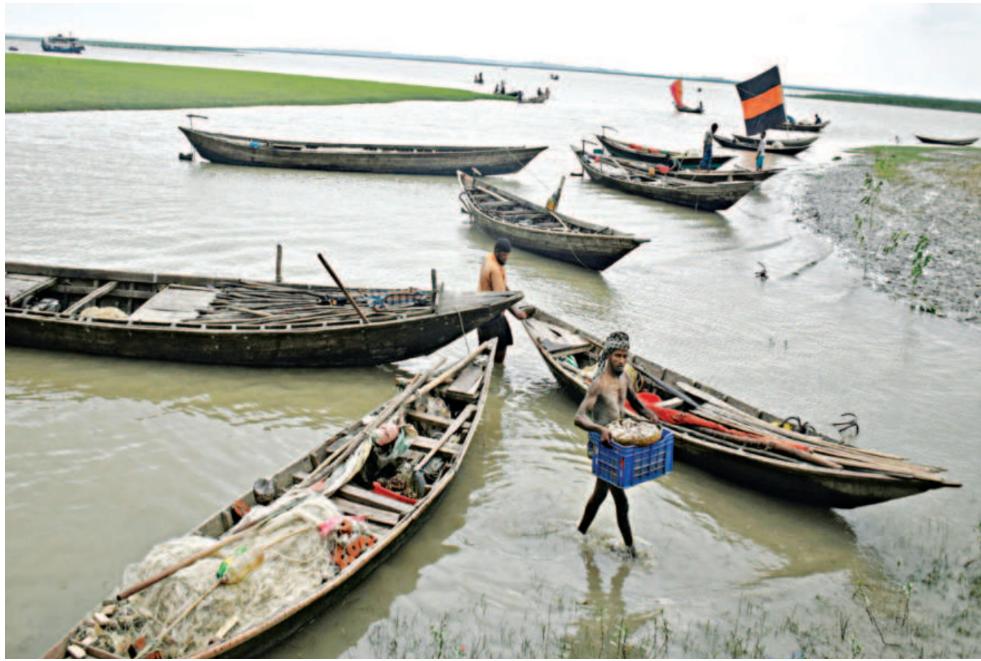
A fisherman going to Bheduriya Ghat Bazar in Barishal Sadar upazila to sell his catch. Fishermen fish in the Kalabadar river and sell their catches at the bazar where different types of local fish are sold at wholesale prices. The photo was taken on Saturday.