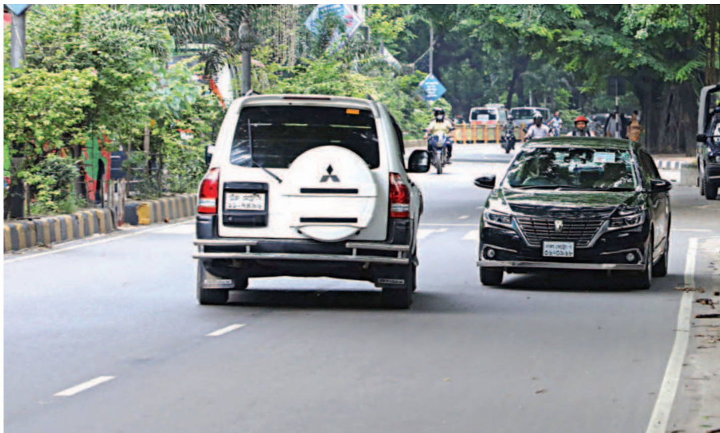
An SUV goes against traffic on Hare Road in the capital yesterday. Drivers, especially those employed by people with influence, are often seen putting other road users in danger.

A new era for Russia's fast-food and economic scene dawned on Sunday, as McDonald's MCD.N restaurants flung open their doors in Moscow under new Russian ownership and with the new name, which translates as "Tasty and that's it".