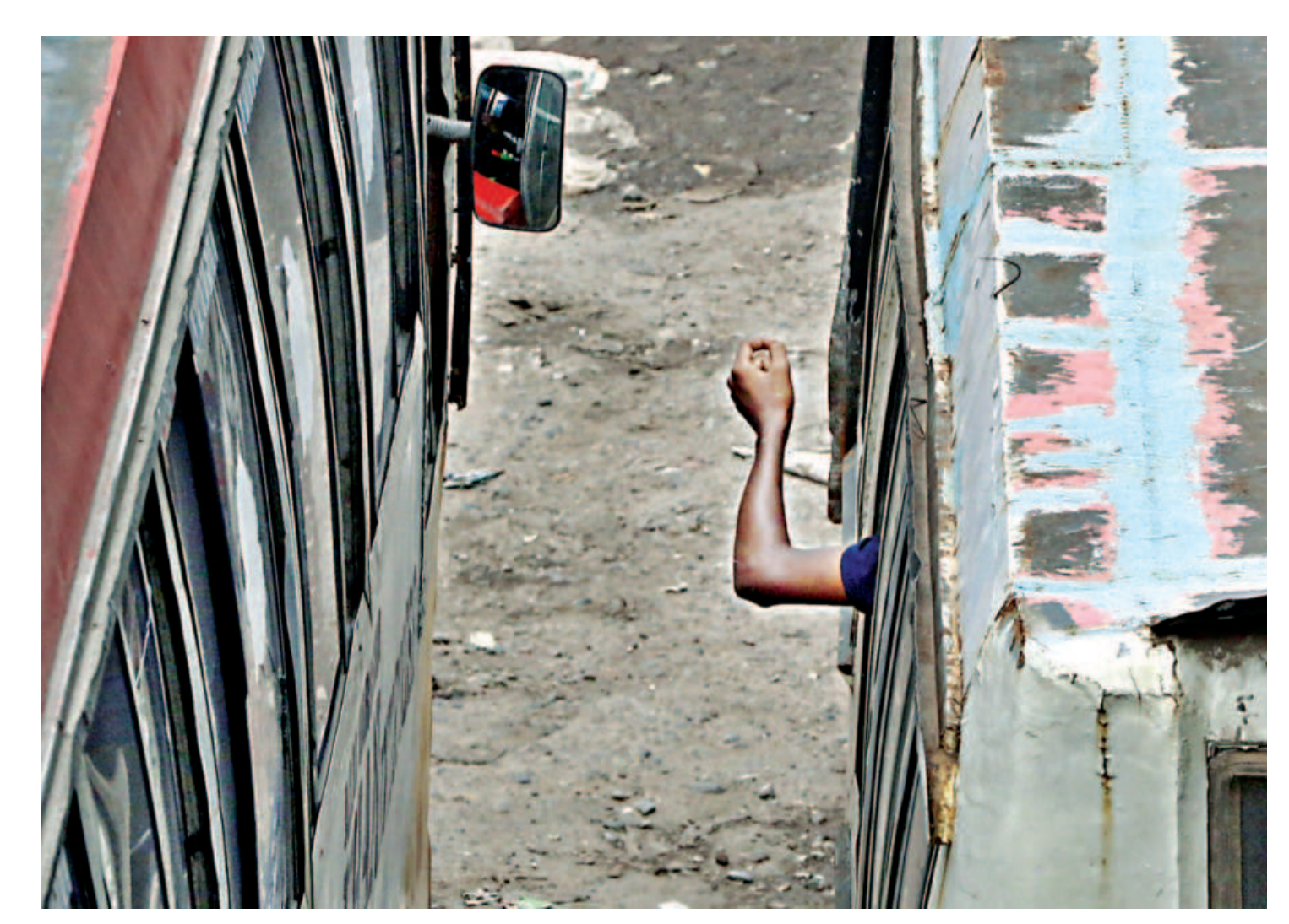
A man dangling his hand outside a bus while another bus wheezes by. Such carelessness may lead to fatal accidents. In 2018, a college student's arm was crushed after being squeezed between two buses in the city. He later died. The photo was taken in the capital's Sayedabad area yesterday.

Hasina said whenever she was arrested, she sent letters