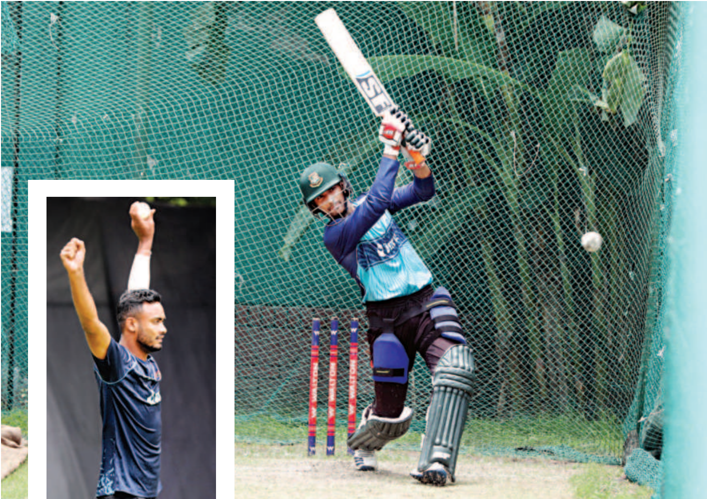
Bangladesh T20 captain Mahmudullah Riyad and pacer Shoriful Islam continued to practise at the Sher-e-Bangla National Stadium in Mirpur yesterday as they prepare to travel to the Caribbean after completion of the first Test of the two-match series. They are likely to join the team in the West Indies on June 25 before the white-ball action starts with the first T20I from July 2.