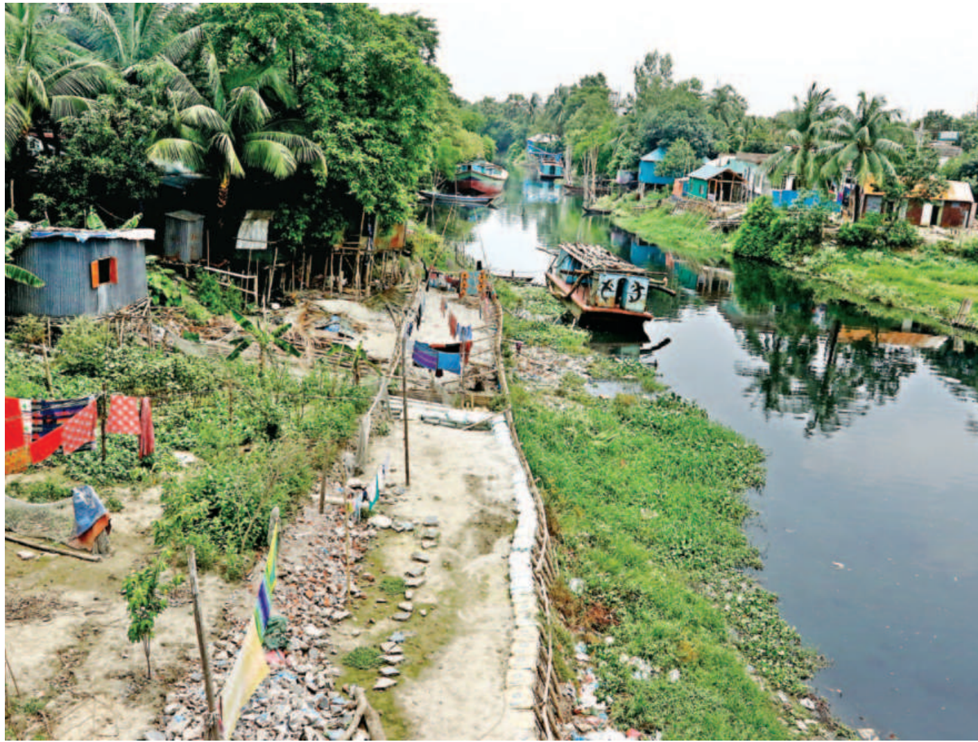
These homesteads in Trimohoni area in the capital's Khilgaon have been built by filling up part of the Jirani canal. This part of the canal, which falls under the Dhaka South City Corporation, was much wider a few years ago. The photo was taken recently.