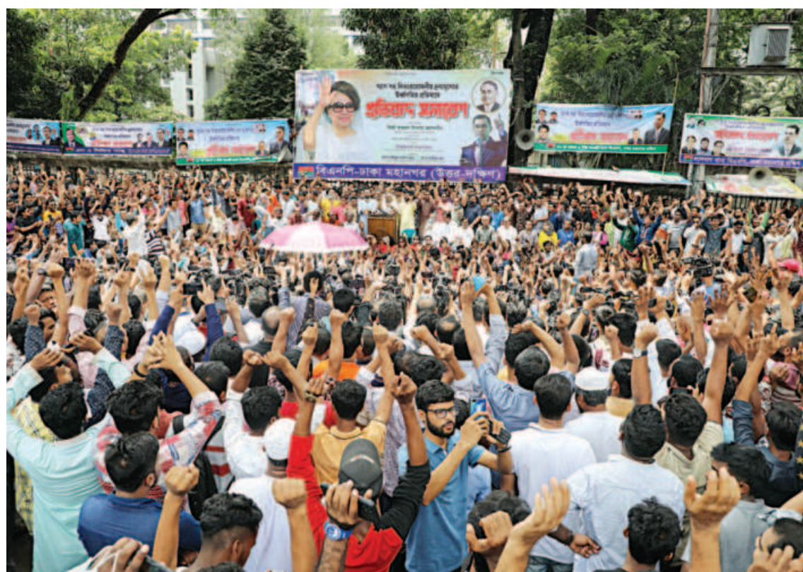
BNP supporters attending a rally in front of the Jatiya Press Club in the capital yesterday. The party organised the rally to protest the rising prices of gas and essential commodities.