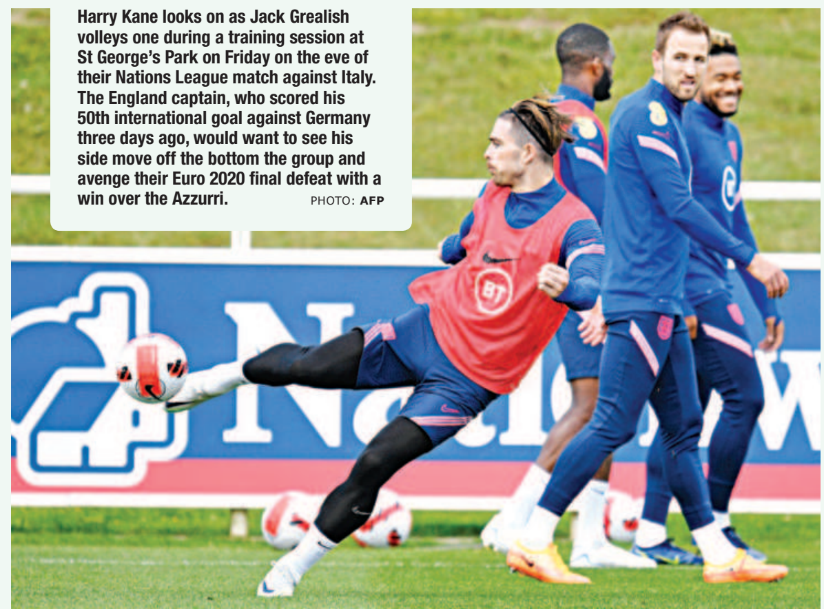
Harry Kane looks on as Jack Grealish volleys one during a training session at St George's Park on Friday on the eve of their Nations League match against Italy. The England captain, who scored his 50th international goal against Germany three days ago, would want to see his side move off the bottom of the group and avenge their Euro 2020 final defeat with a win over the Azzurri.