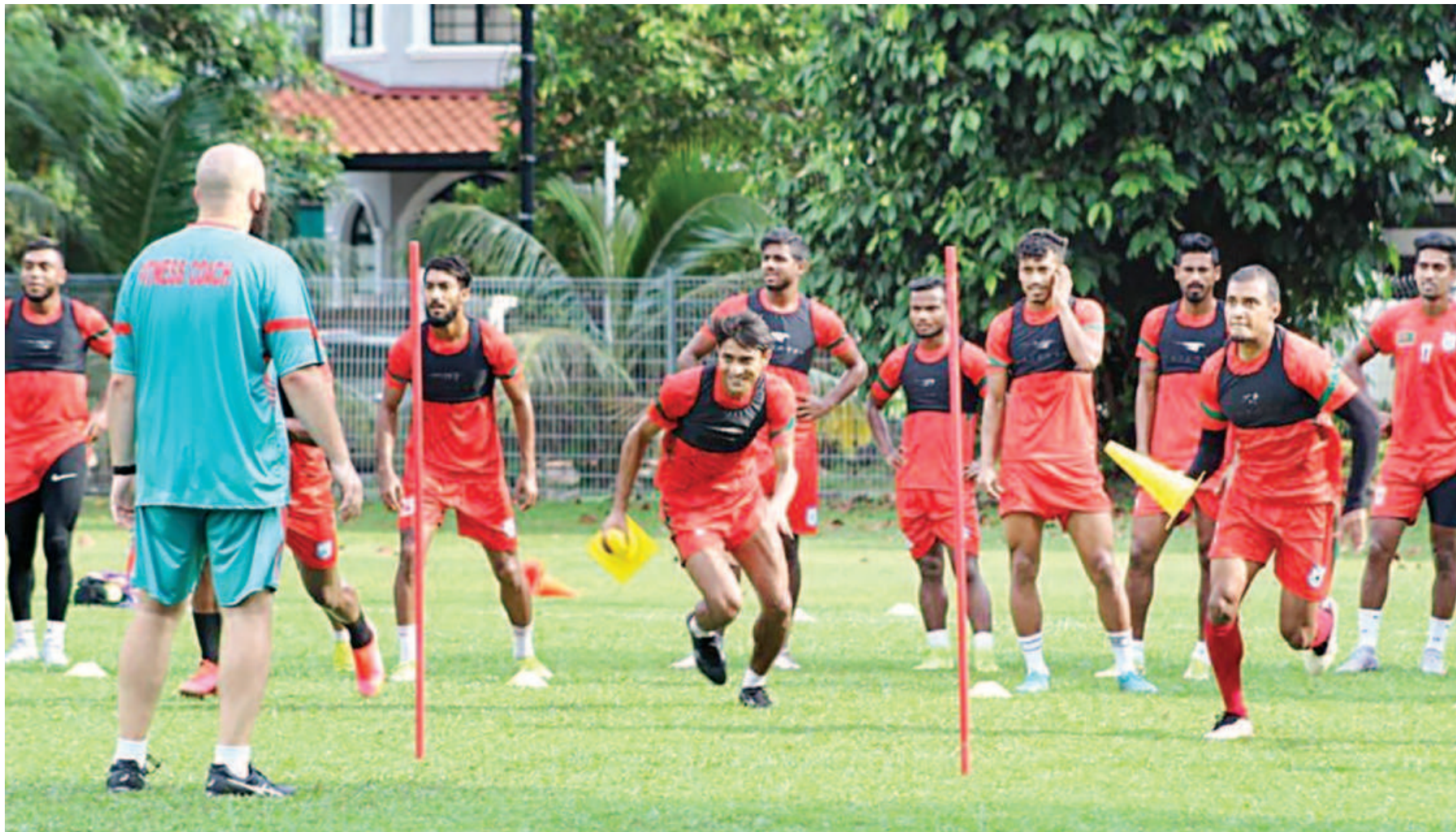
After having started the Asian Cup Qualifiers campaign with a 2-0 defeat to Bahrain, Bangladesh will look to put up a better performance when they face Turkmenistan in Kuala Lumpur today.