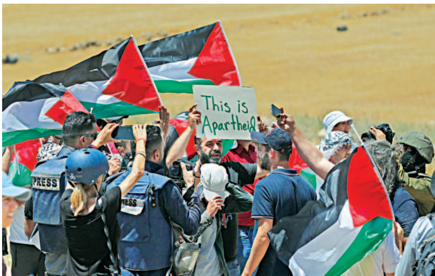
Demonstrators raise Palestinian flags, as Palestinian, left-wing Israeli and foreign activists gather to protest near the West Bank Israeli settlement of Mitzpe Yair in the southern district of Hebron, against a High Court decision to evict Palestinian communities from Fire Zone 918, yesterday.