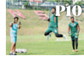
P10 Booters face Turkmenistan today