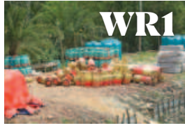
WR1 Sitakunda people are living in a death trap