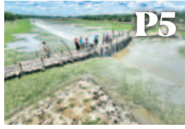
P5 Bhadra silts up within 2yrs of re-excavation