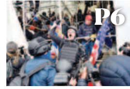
P6 Trump accused of 'coup attempt' in Capitol riot