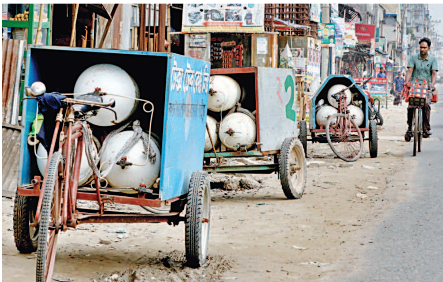
Rickshaw vans, with CNG cylinders installed on them, wait to enter the BSCIC Industrial Estate in Gazipur's Tongi. Refilled at a nearby CNG filling station, the cylinders are used to supply gas to some factories there. Such a risky method of supplying gas could cause accidents. The photo was taken recently.