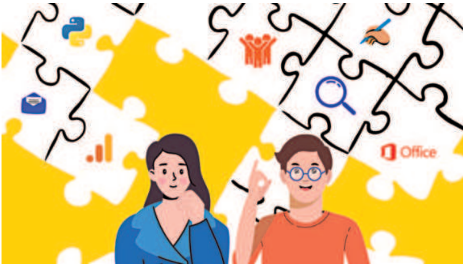
ILLUSTRATION: TANZID SAMAD CHOUHDURY

In the end, soft skills allow organisations to use technical skills and knowledge efficiently without being slowed down by incoming challenges and conflicts, while hard skills help pave the path to becoming a more qualified individual. You can always stay one step ahead of the game by obtaining a unique set of skills that reflects your authenticity as a worthy candidate in the ever-changing job market.