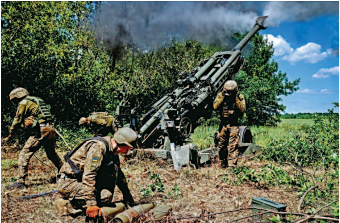
Ukrainian service members fire a shell from a M777 Howitzer near a frontline, as Russia’s attack on Ukraine continues, in Donetsk Region on Monday.