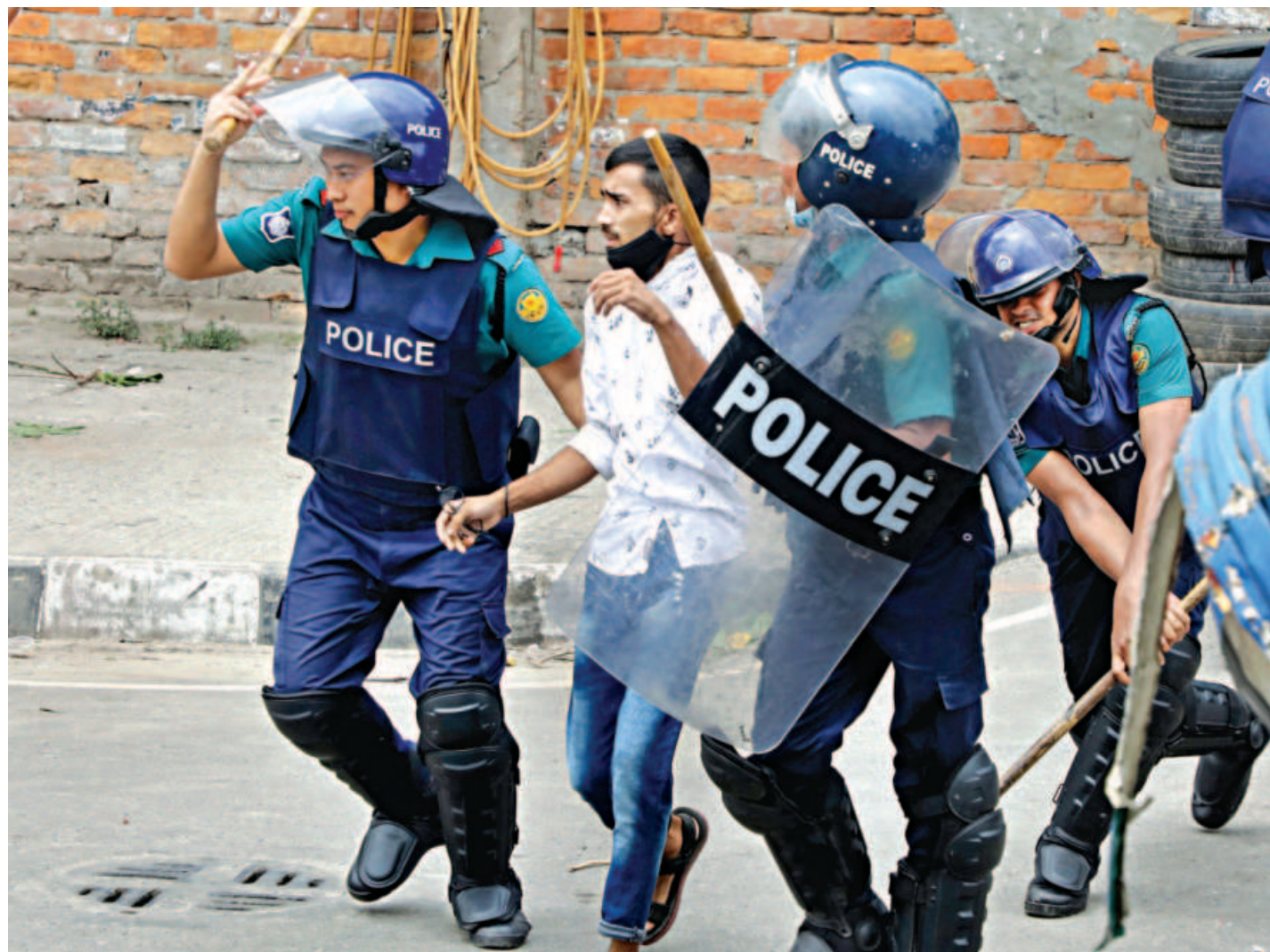
Cops rough up a garment worker after picking him up during a protest in the capital's Mirpur yesterday morning. The workers had been demonstrating for four days straight, demanding an increase in wages in the wake of price hikes of essentials.

Earlier, the minimum monthly wage of garment workers was raised to Tk 8,000 in December in 2018.