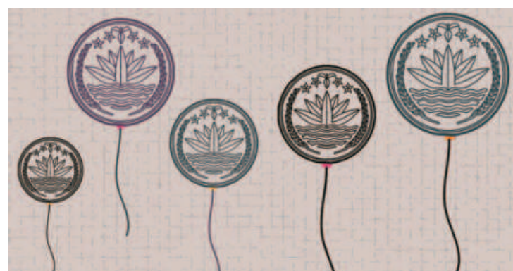
▲ VISUAL: TEENI AND TUNI

Prices, once raised, don't tend to fall that smoothly – a notion that economist John Maynard Keynes termed "downward rigidity" or "stickiness of prices." And that is the case for Bangladesh, suggesting the country's inflation will sustain longer even after the compelling factors weaken or disappear.