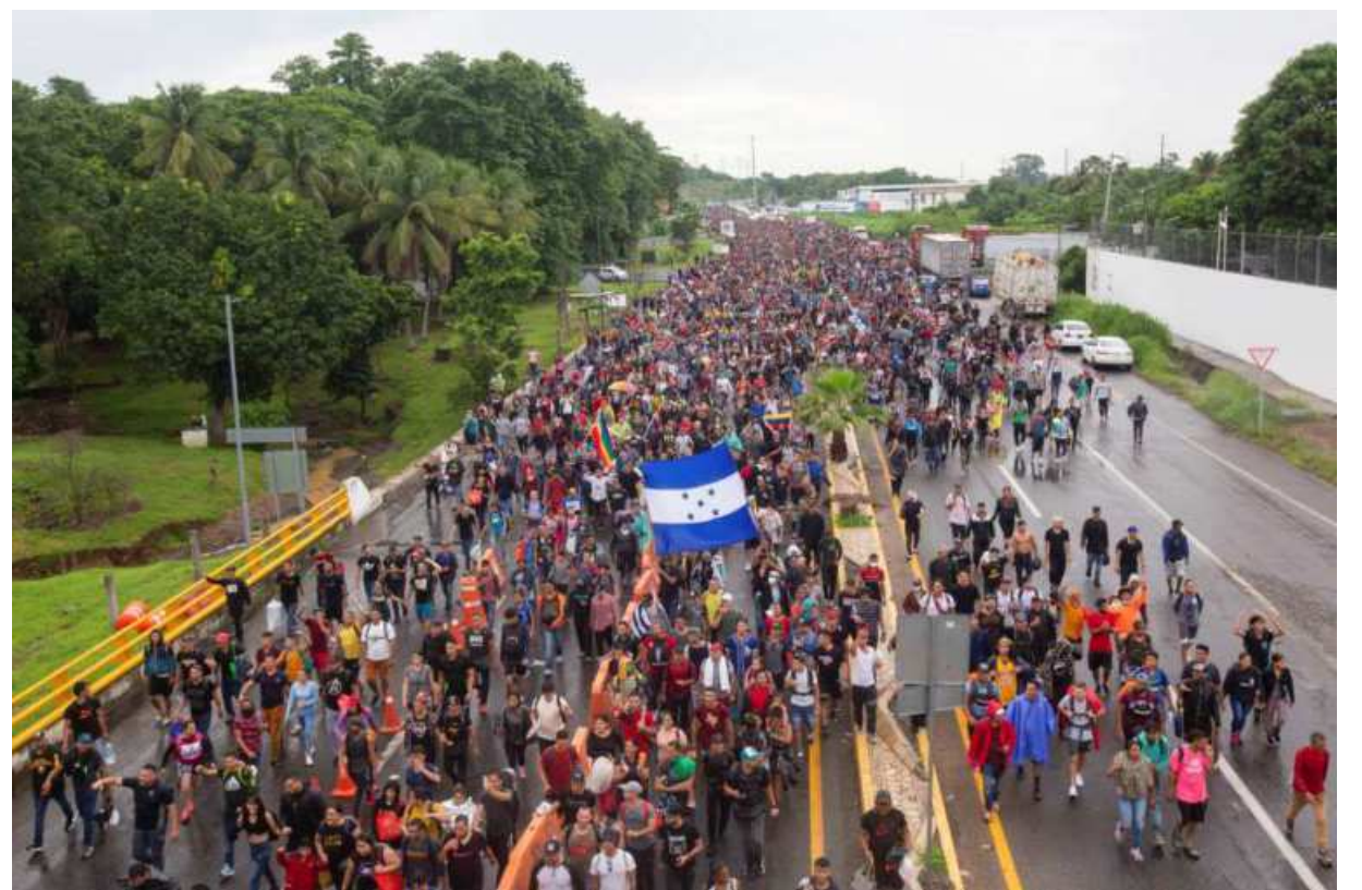
Migrants walk in a caravan to cross the country to reach the US border, as regional leaders gather in Los Angeles to discuss migration and other issues, in Tapachula, Mexico yesterday.