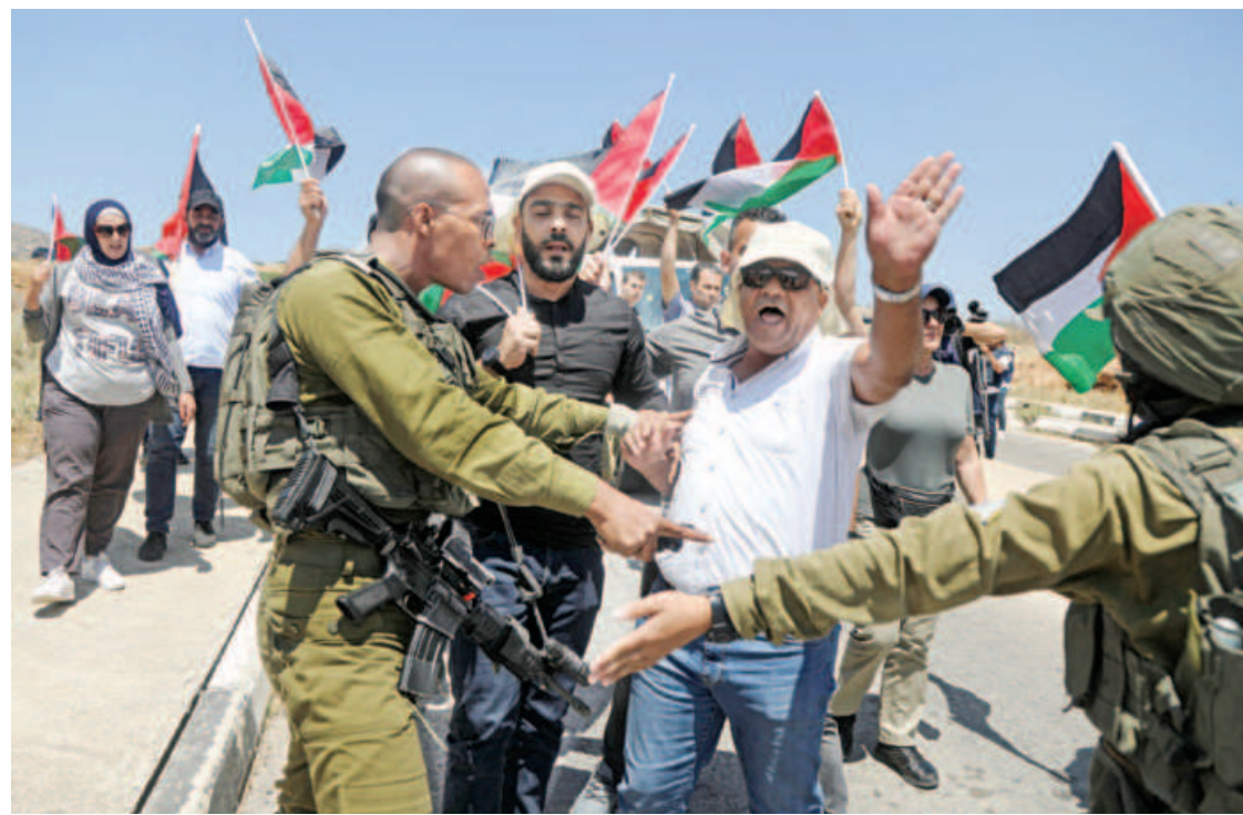
Israeli soldiers argue with Palestinian demonstrators during a protest against Israeli settlements in Jordan Valley in the Israeli-occupied West Bank yesterday.