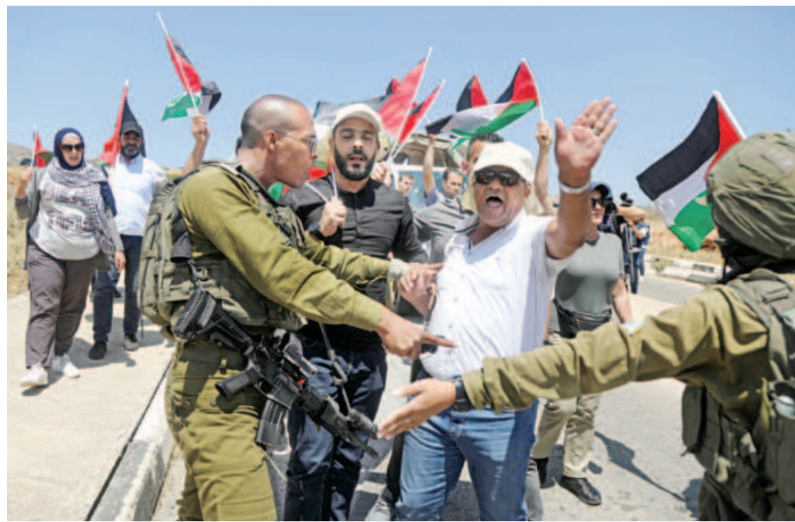
Israeli soldiers argue with Palestinian demonstrators during a protest against Israeli settlements in Jordan Valley in the Israeli-occupied West Bank yesterday.