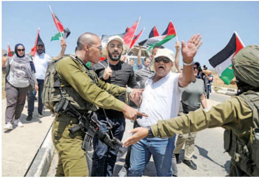
Israeli soldiers argue with Palestinian demonstrators during a protest against Israeli settlements in Jordan Valley in the Israeli-occupied West Bank yesterday.

The arrests in the city of Kanpur were part of an effort to quell sporadic religious tension that arose after two officials from Prime Minister Narendra Modi's Hindu nationalist