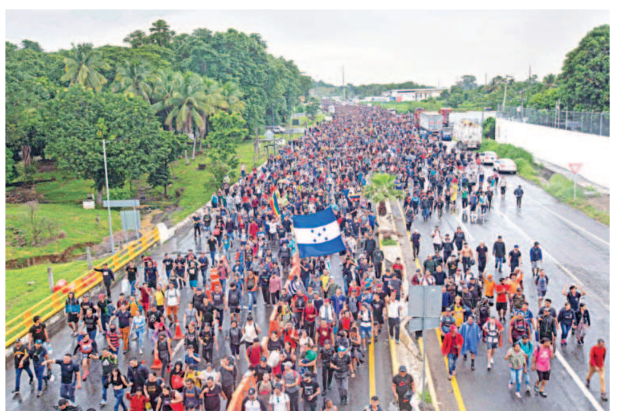
Migrants walk in a caravan to cross the country to reach the US border, as regional leaders gather in Los Angeles to discuss migration and other issues, in Tapachula, Mexico yesterday.