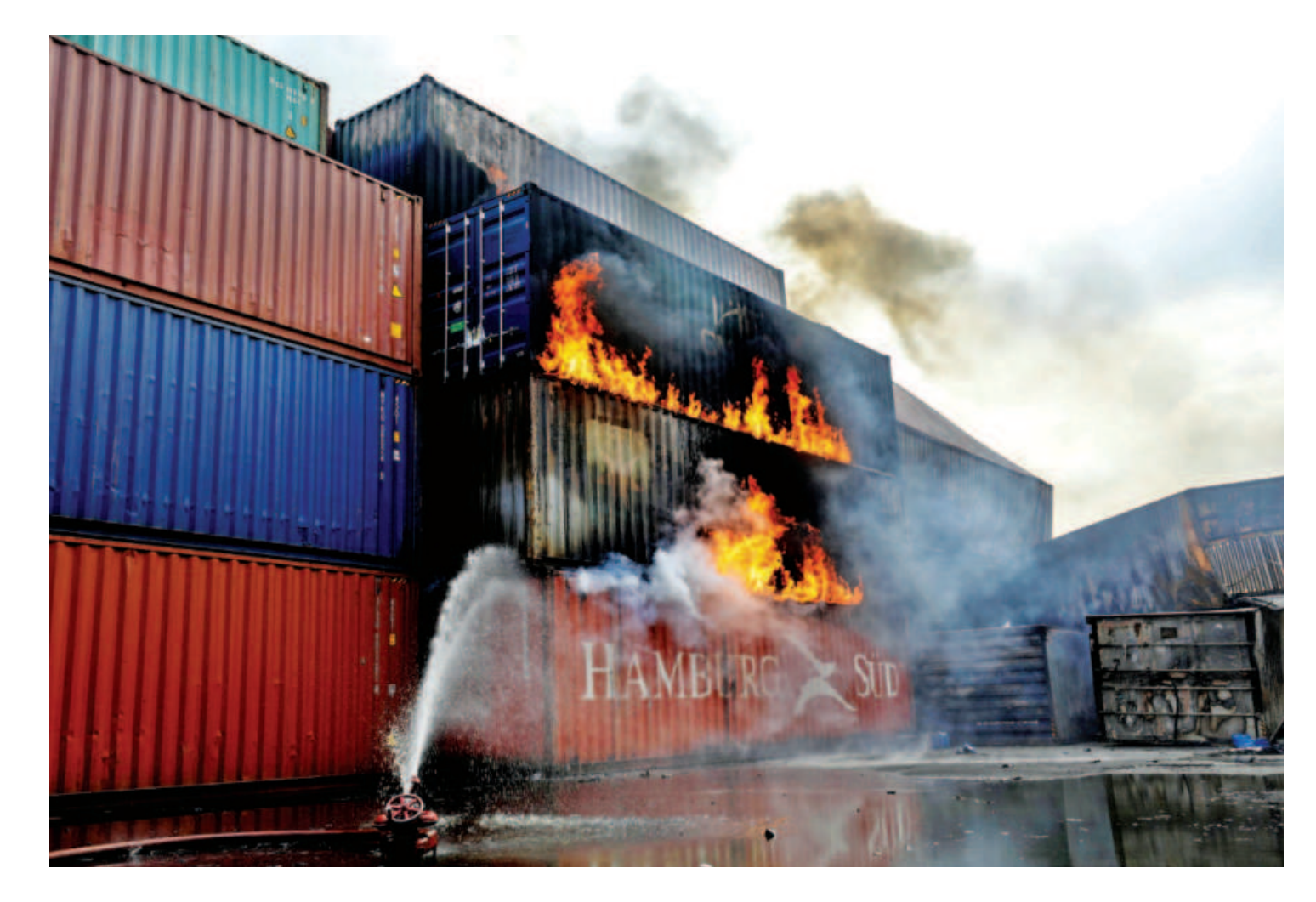
Water being sprayed on shipping containers at BM Container Depot in Sitakunda, Chattogram, around 11:00am yesterday. Firefighters were still working to douse the blaze that started Saturday night.

The doctor said he came SEE PAGE 6 COL 3