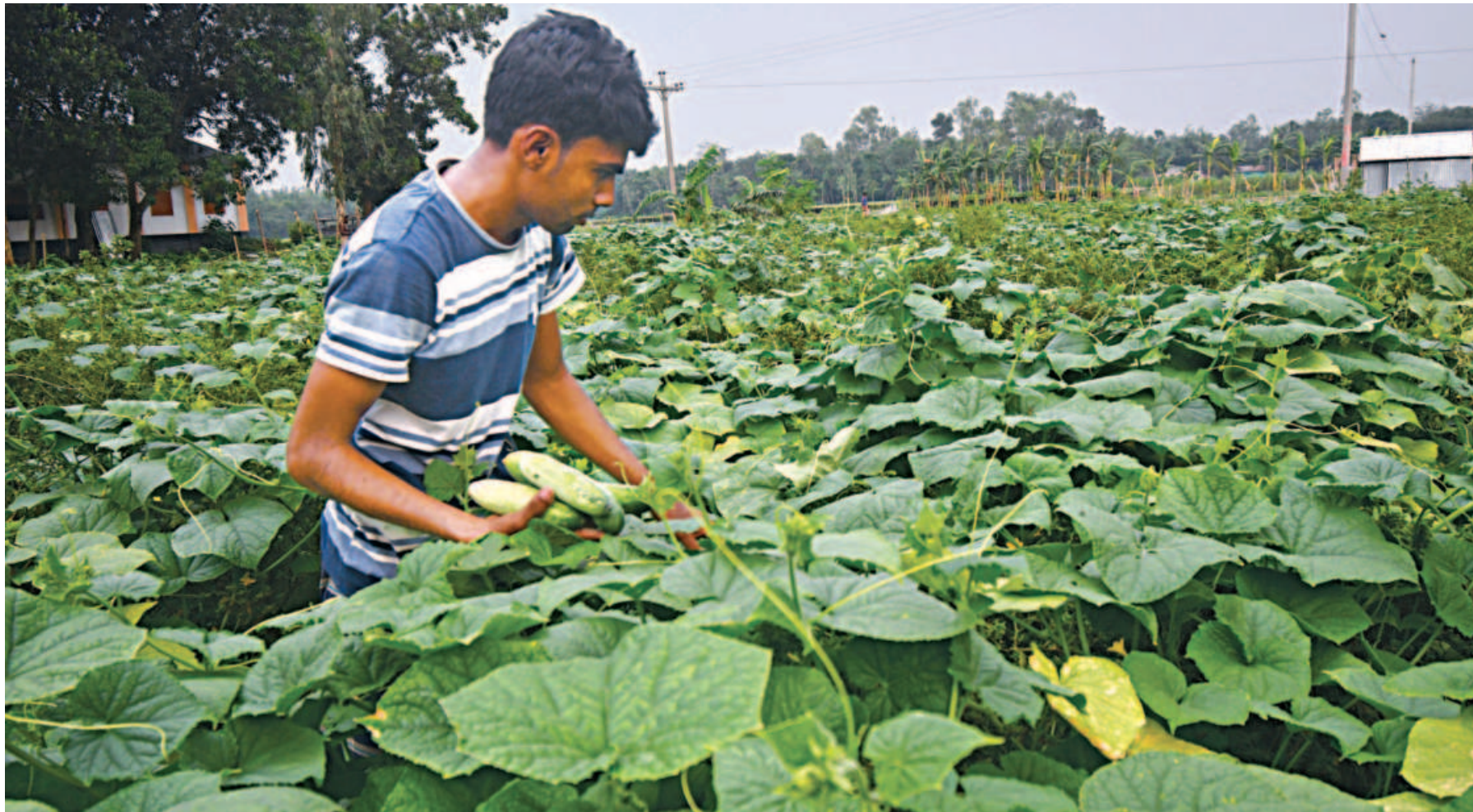
A farmer plucks cucumbers in Shajapur of Bogura's Shahjahanpur upazila. Rich in vitamin C, calcium and carbohydrate, cucumbers are cultivated between February and April, with either seeds directly sown or through the transplantation of 15-20 days old seedlings. Harvesting begins after 45 to 55 days, according to Bangladesh. Some 94,900 tonnes of cucumber were grown on around 25,288 acres of land in the country in fiscal year 2020-21, according to the Bangladesh Bureau of Statistics. The photo was taken last week.