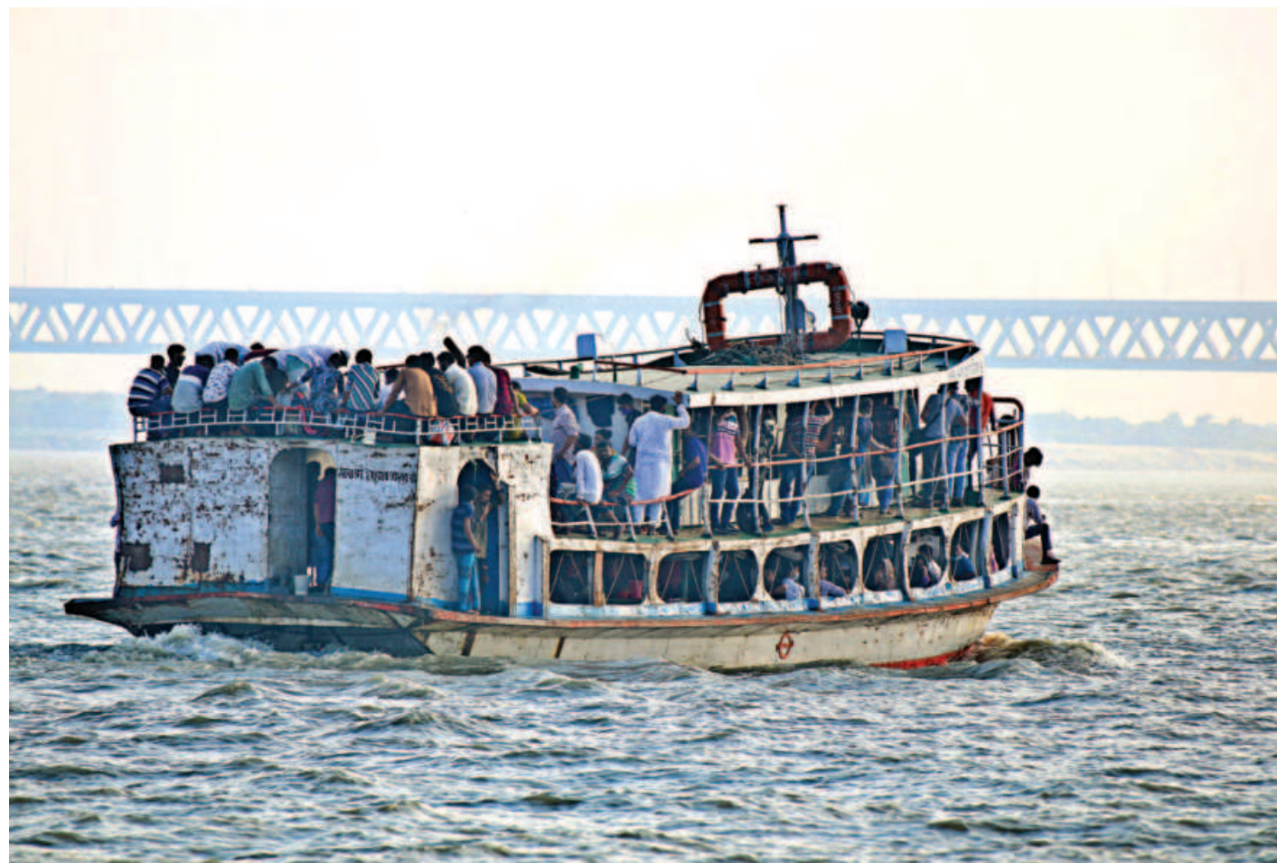
A launch carrying passengers across the Padma yesterday. The vessel travels from Munshiganj's Shimulia to Madaripur's Banglabazar and back. Such trips could become a thing of the past once the Padma Bridge, right behind, opens to the public this month.