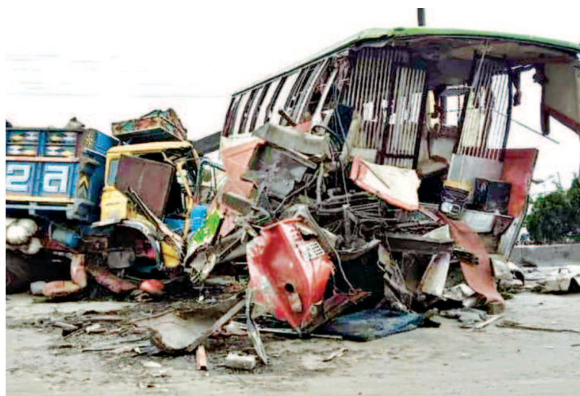
The wreckage of a runaway bus that hit a staff bus of the Bangladesh Atomic Energy Commission and killed four of its employees, including the driver, on the Dhaka-Aricha highway in Savar's Boliarpur yesterday morning. It also hit two other vehicles.