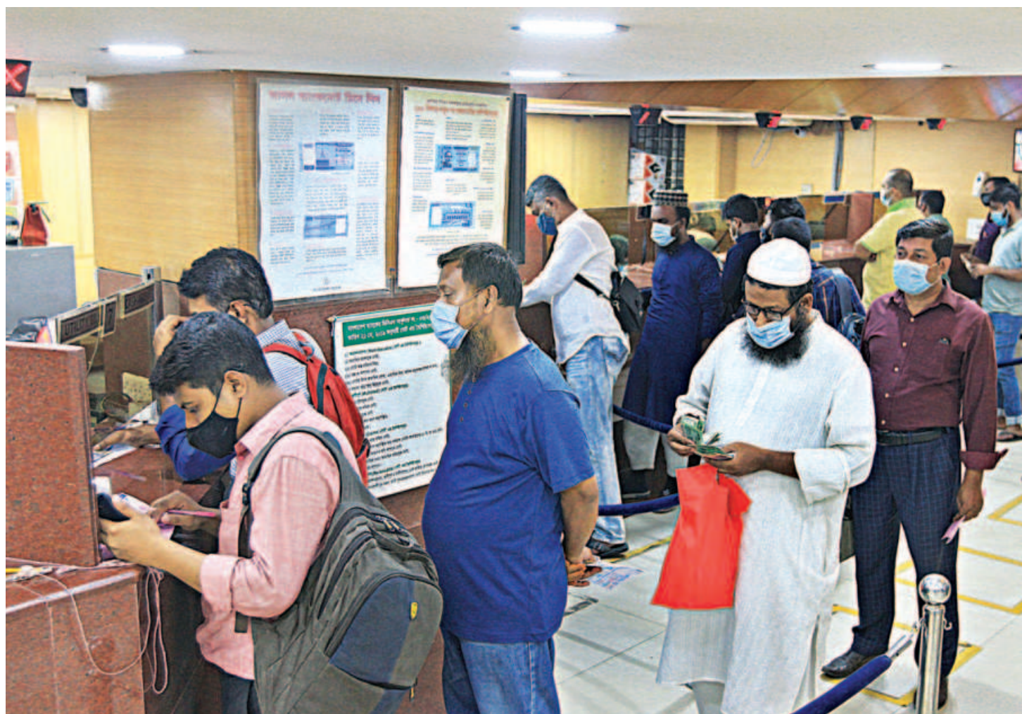
The real interest rate on bank deposits has reached an unprecedented stage in recent past causing the value of the savings of ordinary people to fall, an expert says.