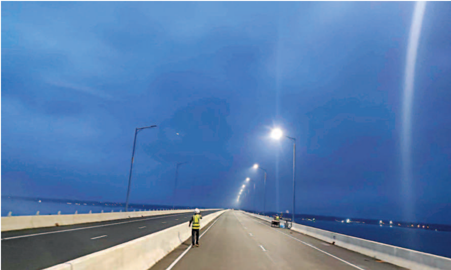
Engineers experimentally illuminating some of the 415 LED lamps that would light up the Padma Bridge once it is inaugurated. The photo was taken yesterday.