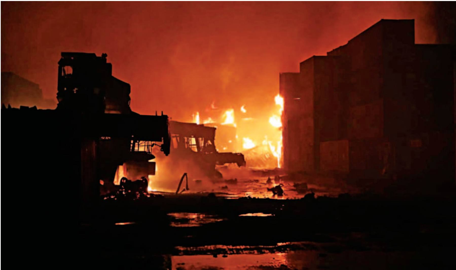
A massive fire burns a private container depot in Chattogram's Sitakunda to ashes, claiming at least four lives and injuring over a hundred. The photo was taken around 2:30am today.