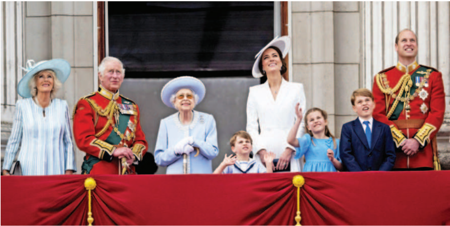
The Queen along with members of the Royal Family watches the special flypast by Britain's Royal Air Force from Buckingham Palace balcony following the Trooping the Colour parade, as a part of her platinum jubilee celebrations, in London, Britain, yesterday.