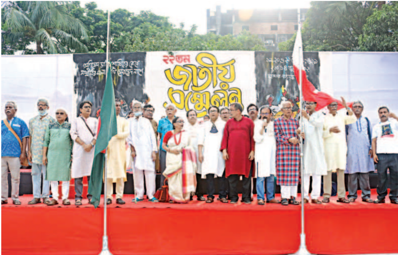
Bangladesh Udichi Shilpi Goshti's 22nd National Assembly began at Dhaka Mohanagar Natya Mancha yesterday. The three-day event aims to protest fundamentalist ideology, through cultural unity.