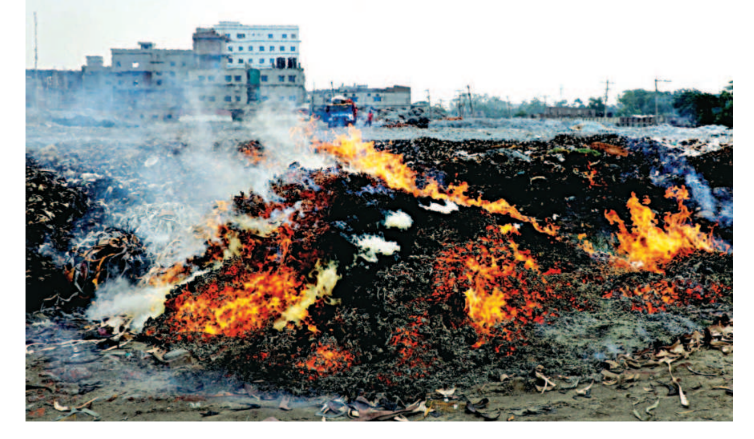
Solid leather waste being burned at a dump yard inside BSCIC Tannery Industrial Estate in Savar yesterday. Such acts cause air pollution and harm public health. A parliamentary body recently recommended shutting down the estate over environmental rules violations.

The universities that agreed to hold integrated admission tests are Bangabandhu Sheikh Mujibur Rahman University, Kishoreganj; Chandpur Science and Technology University; Jagannath University; Islamic University, Kushtia; Khulna University; Comilla University; Jatiya Kabi Kazi Nazrul Islam University; Begum Rokeya University, Rangpur; University of Barisal; Rabindra University, Shahzadpur; Bangabandhu Sheikh Mujibur Rahman Digital University; Sheikh Hasina University, Netrakona; Shahjalal University of Science and Technology, SEE PAGE 6 COL 5