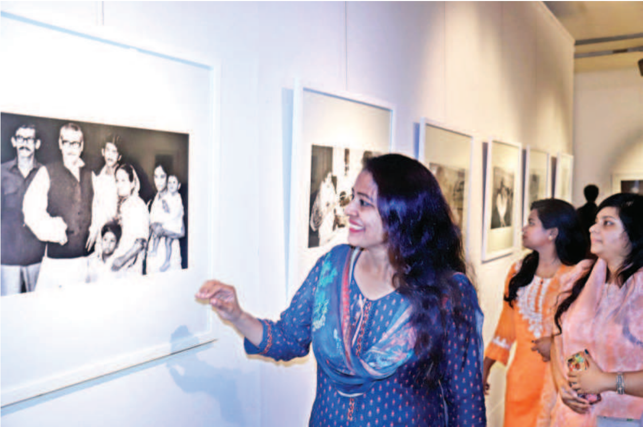
Visitors at a photo exhibition titled “Bangabandhu and Ruposhi Bangla” at the National Gallery No-3 of Shilpakala Academy in Dhaka yesterday. Bangladesh Photojournalists Association and Bangladesh Shilpakala Academy jointly organised the event.

Admittedly, a lack of accountability is creating “irresponsible” teachers. But can