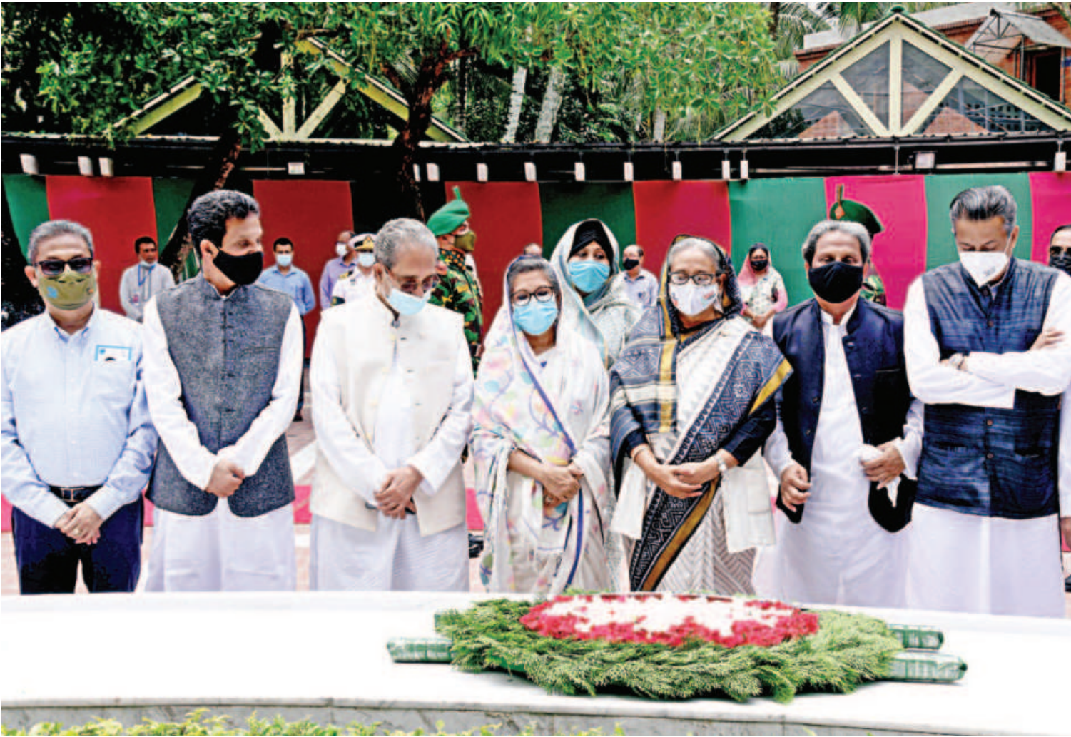
Prime Minister Sheikh Hasina, accompanied by her younger sister Sheikh Rehana and other family members, yesterday offered prayers at the mausoleum of Father of the Nation Bangabandhu Sheikh Mujibur Rahman in Tungipara of Gopalganj.