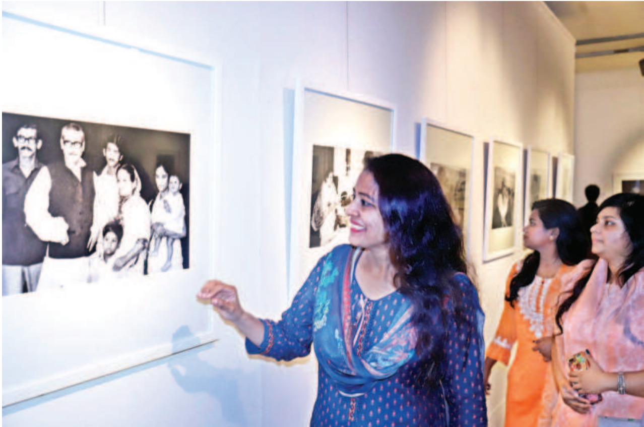
Visitors at a photo exhibition titled “Bangabandhu and Ruposhi Bangla” at the National Gallery No-3 of Shilpakala Academy in Dhaka yesterday. Bangladesh Photojournalists Association and Bangladesh Shilpakala Academy jointly organised the event.