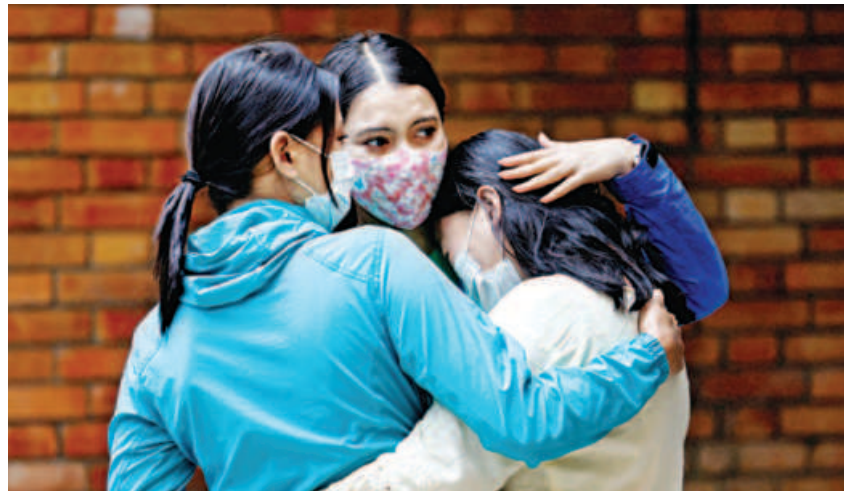
Relatives of victims of the crashed Tara Air passenger plane cry as they wait for the bodies of their loved ones at a morgue in Kathmandu, Nepal, yesterday. Nepali rescuers have retrieved all 22 bodies from the plane that crashed in the Himalayas, authorities said yesterday.

Stressing that there is no evidence filters provide any proven health benefits over smoking non-filtered cigarettes, the UN urged policy makers worldwide to consider banning them.