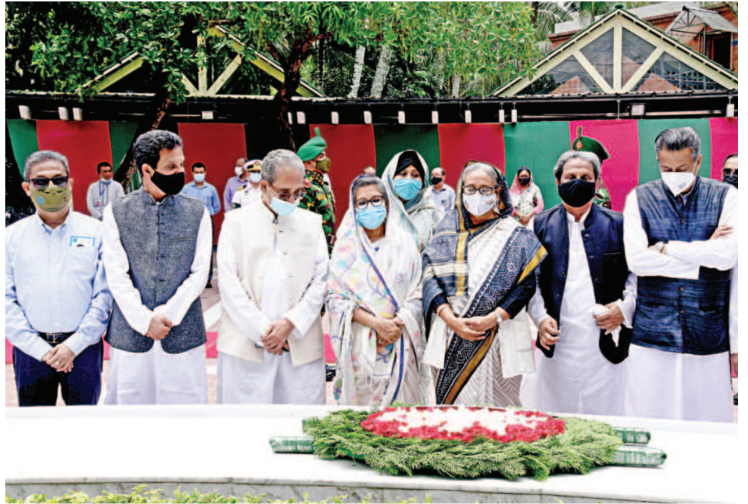
Prime Minister Sheikh Hasina, accompanied by her younger sister Sheikh Rehana and other family members, yesterday offered prayers at the mausoleum of Father of the Nation Bangabandhu Sheikh Mujibur Rahman in Tungipara of Gopalganj.