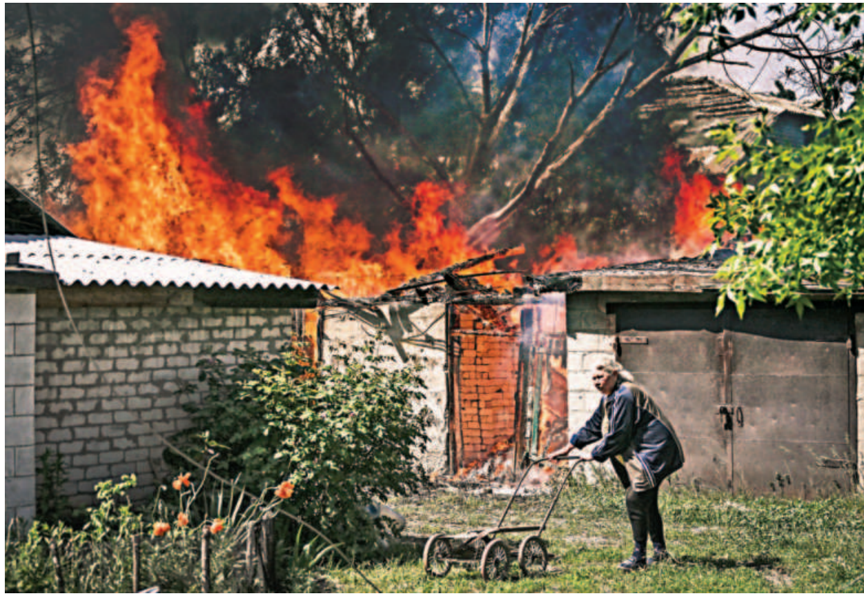
An elderly woman walks away from a burning house garage after shelling in the city of Lysychansk at the eastern Ukrainian region of Donbas on Monday, on the 96th day of the Russian invasion of Ukraine.

This year, in coordination with the fisheries department, the restriction has been extended by a month.