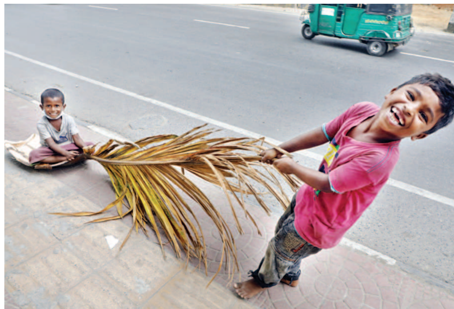
Underprivileged children don't get fair chances in life. They are left with poor playing options. This picture taken recently in the capital's Bangla Motor area shows two children, away from their home, playing on the sidewalk with a fallen branch of a tree.