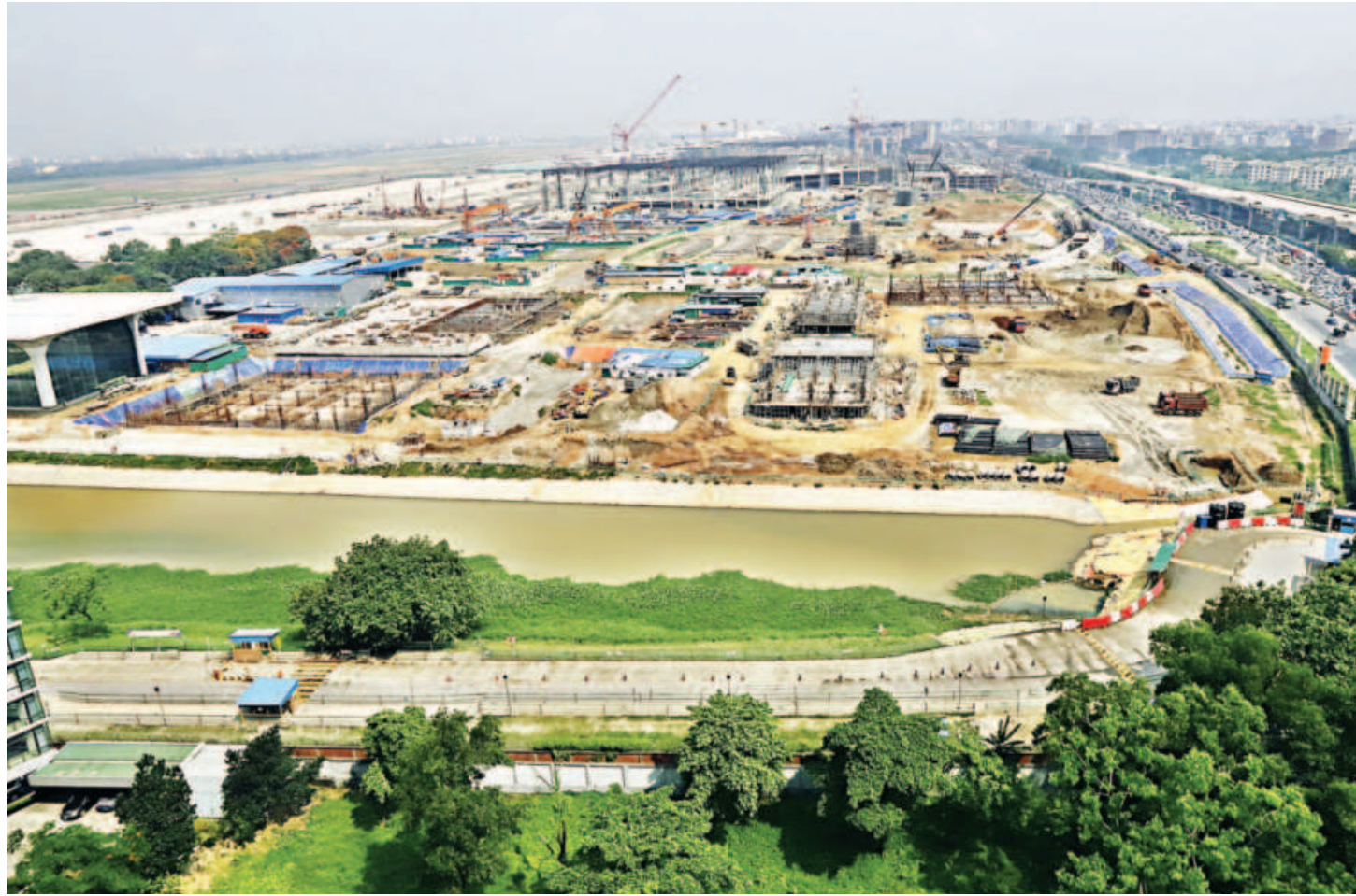
The construction of the third terminal of the Hazrat Shahjalal International Airport in the capital is going on in full swing. A passenger terminal building, roads, an airport apron, a parking lot, a cargo complex, and other structures are being built under the Tk 21,399 crore project. The terminal is likely to be opened by October next year.