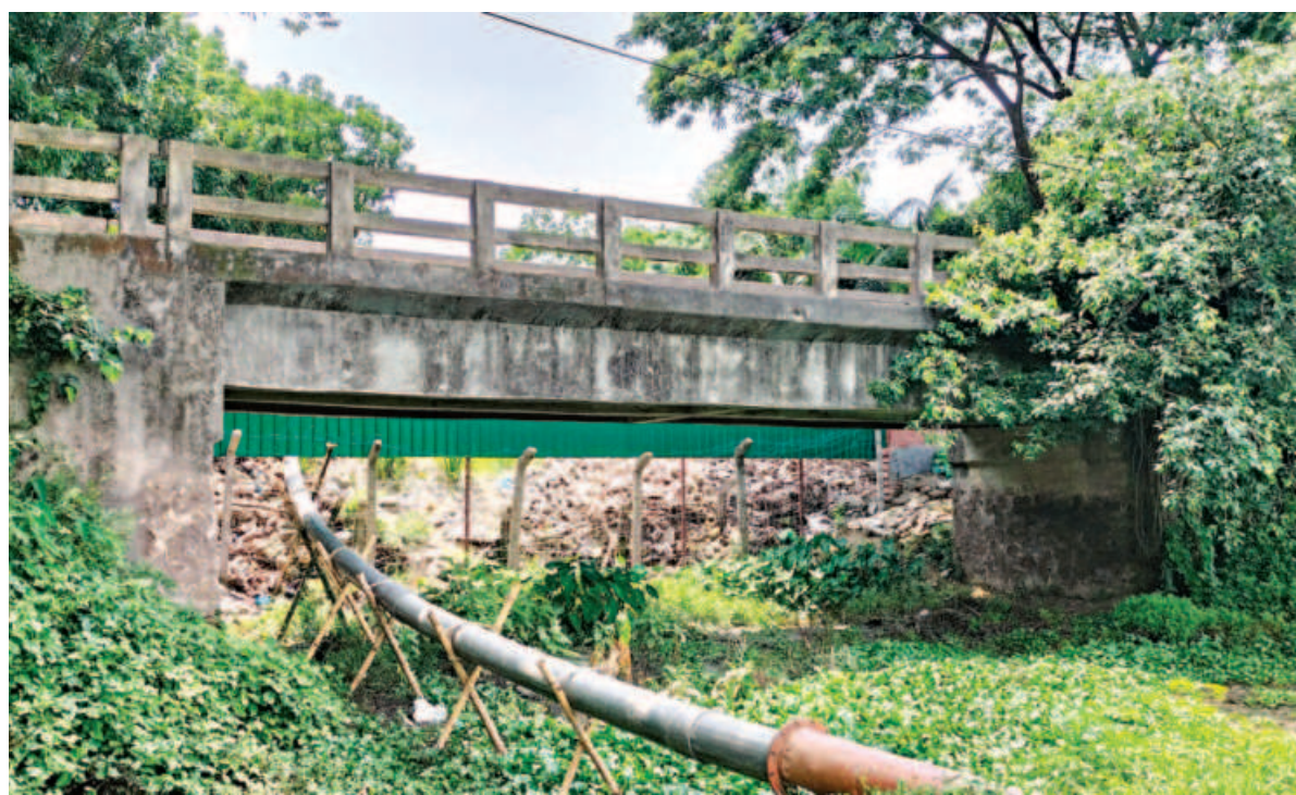
Hundreds of farmers at Purangram village in Manikganj's Ghior upazila are being affected after a company illegally erected structures on an irrigation canal beside Manikganj-Tangail road. The photo was taken recently.