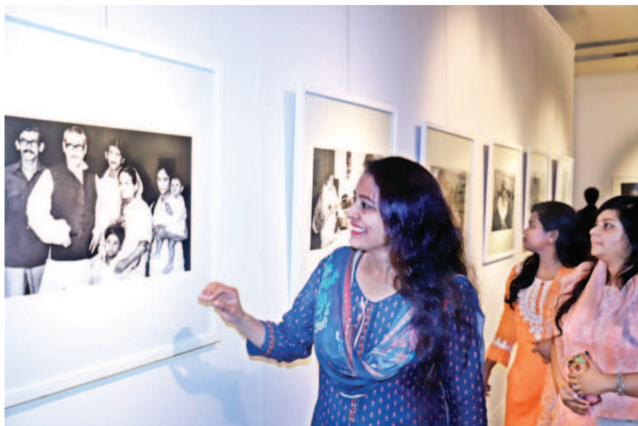
Visitors at a photo exhibition titled "Bangabandhu and Ruposhi Bangla" at the National Gallery No-3 of Shilpakala Academy in Dhaka yesterday. Bangladesh Photojournalists Association and Bangladesh Shilpakala Academy jointly organised the event.