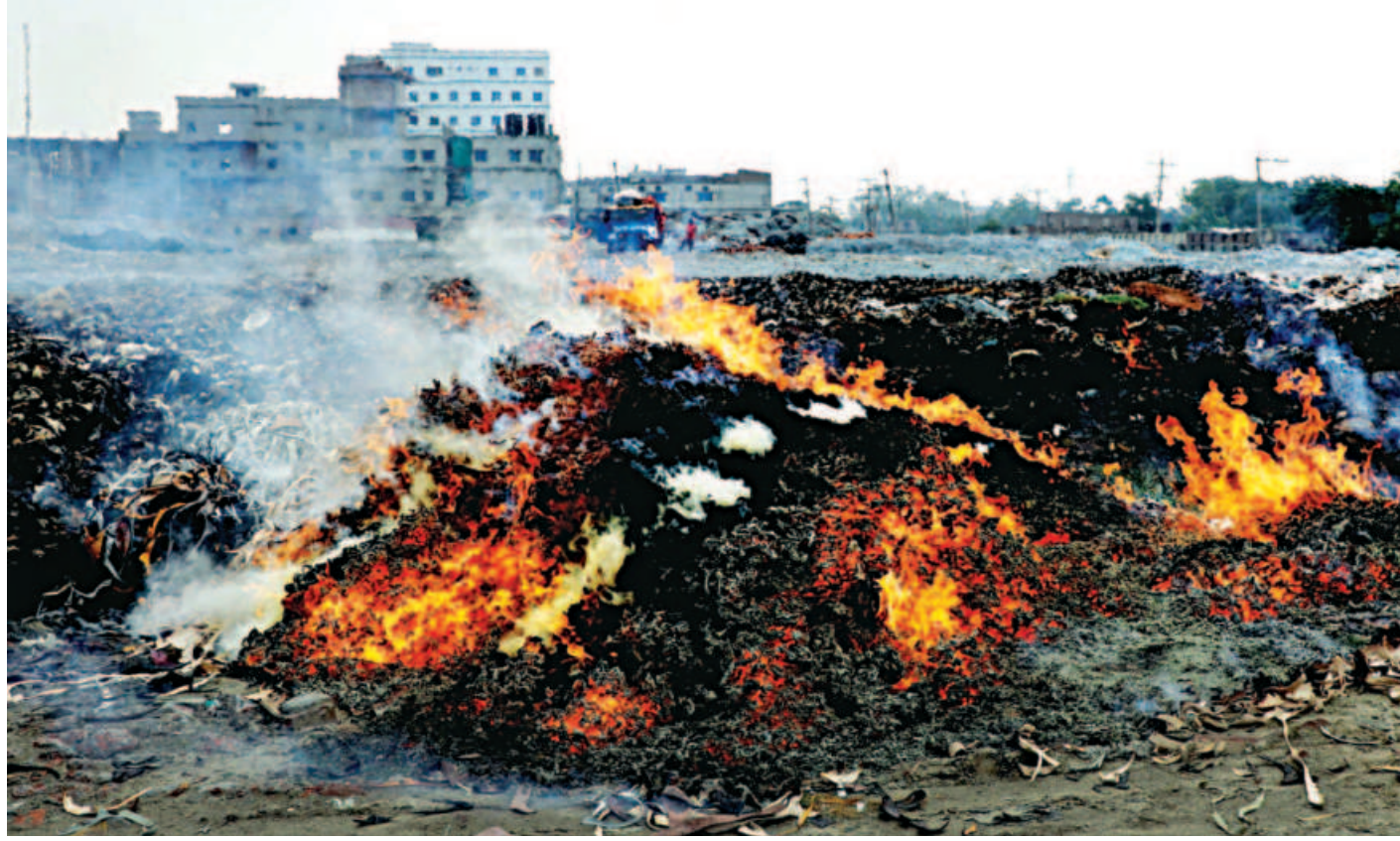
Solid leather waste being burned at a dump yard inside BSCIC Tannery Industrial Estate in Savar yesterday. Such acts cause air pollution and harm public health. A parliamentary body recently recommended shutting down the estate over environmental rules violations.