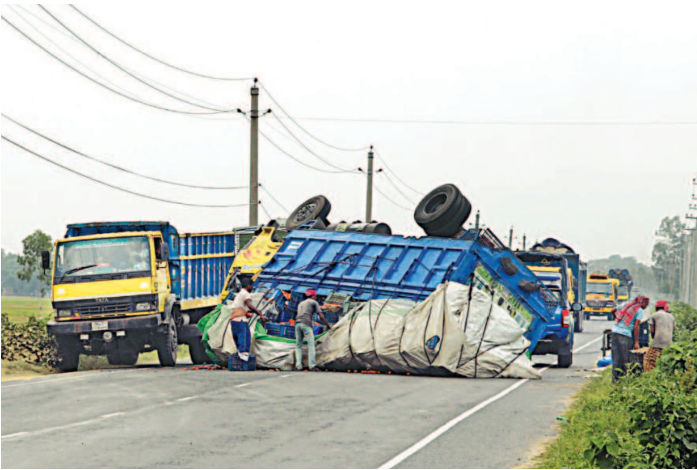
People trying to salvage tomatoes after a truck, heading for Dhaka with the load, flipped on its side at Barai Bazar on Dinajpur-Gobindaganj highway yesterday.