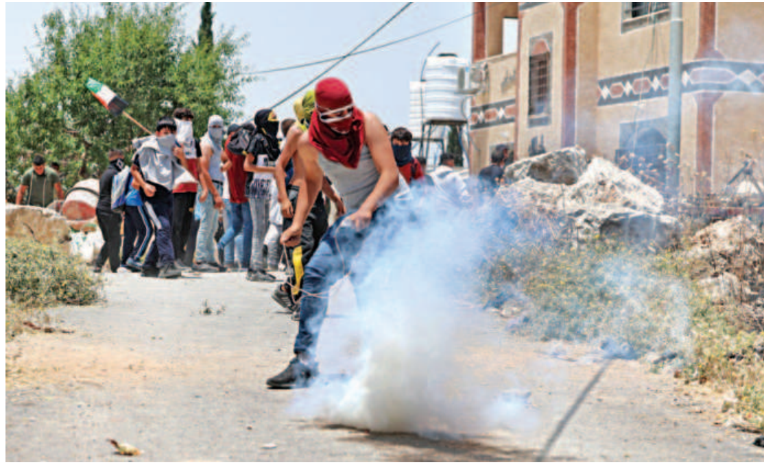
A masked Palestinian protester avoids a tear gas canister amid clashes with Israeli security forces following reported altercations with Israeli settlers in Urif village, south of Nablus in the occupied West Bank, yesterday.

"I leave it to the conscience of those who spread such rumours." Moscow's offensive has killed thousands of people, sparked the biggest refugee crisis in Europe since World War II and led to unprecedented Western sanctions against Moscow.