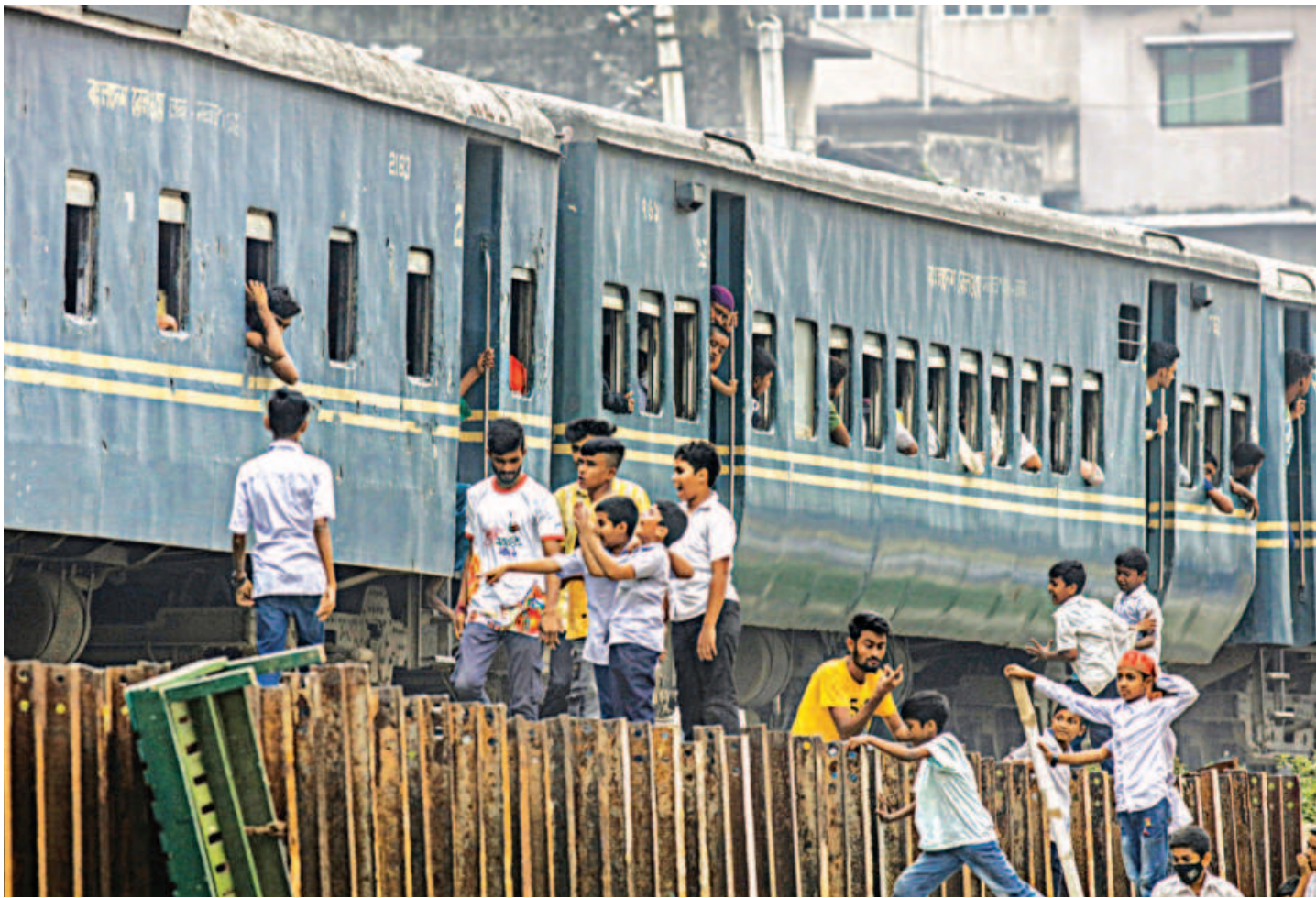
Schoolboys playing dangerously close to a train in the capital's Karatitola. Fatal accidents on the rail lines are not uncommon in the country and people not keeping clear of the tracks is one of the reasons for the tragedies. We are publishing the photo of children to raise awareness about the risks.