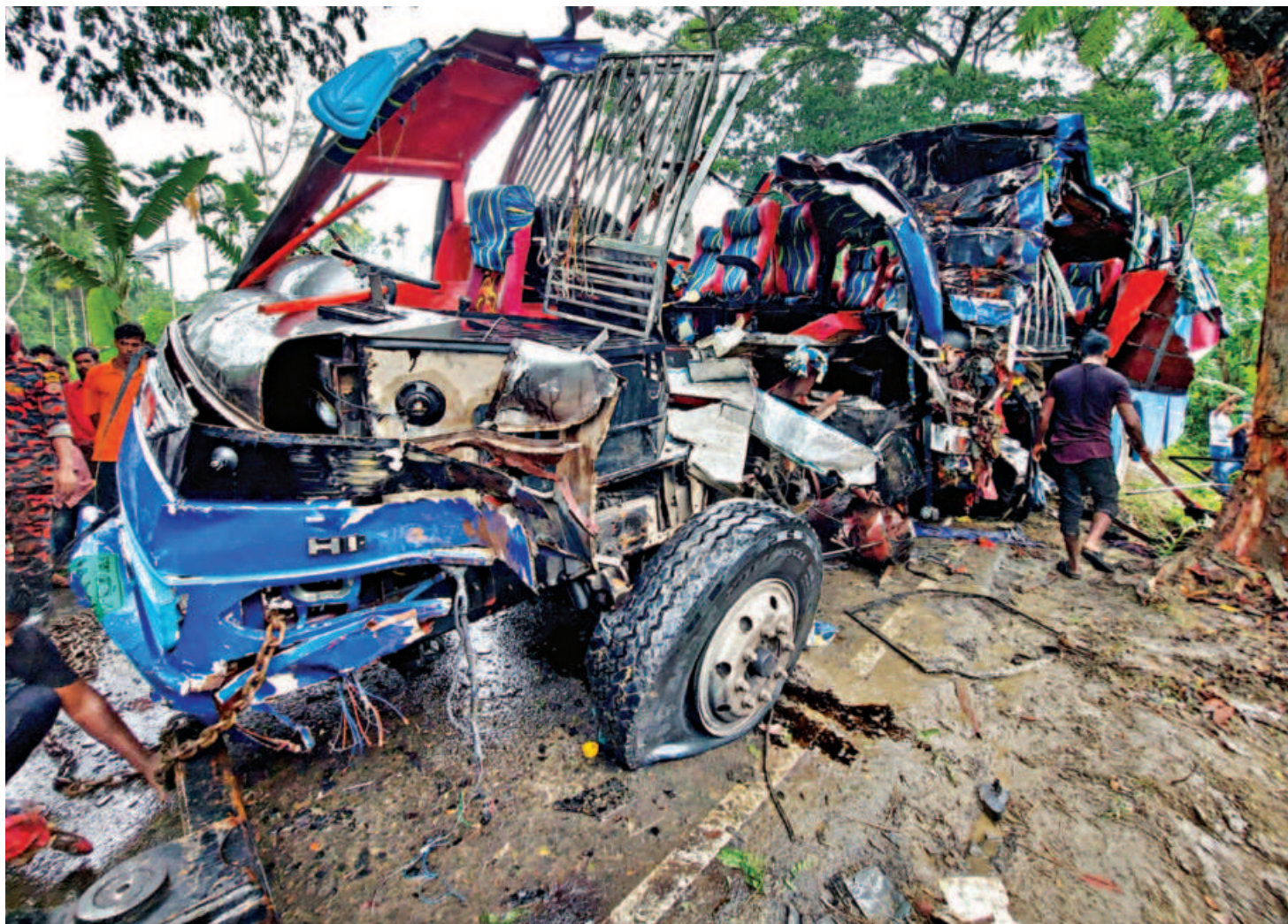
Wreckage of the bus that crashed into a tree in Sanuhar area of Ujirpur, Barishal, early yesterday, killing 10 people and injuring many others. Survivors said the driver was reckless and he would not listen when they asked him to slow down.