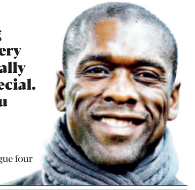
CLARENCE SEEDORF, former Dutch player who won the Champions League four times with three different clubs

“You certainly get used to winning in general. Winning the Champions League is a very particular feeling, but it’s really the journey that makes it special. Every journey that brings you toward a win is important.”