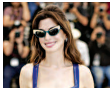
Anne Hathaway poses for photographers at the photo call for the film 'Armageddon Time'.