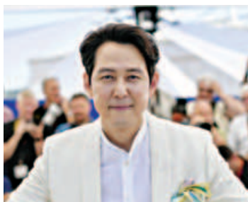
'Squid Game' star Lee Jung-jae poses for photographers at the photo call for the film 'Hunt'.