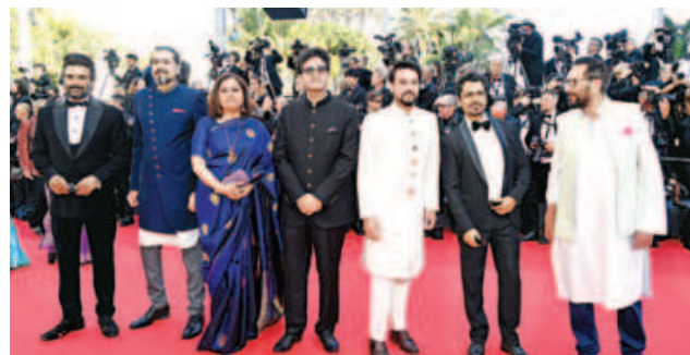
1. (From left) R Madhavan, Ricky Kej, Vani Tripathi, Prasoan Joshi, Anurag Thakur, Nawazuddin Siddiqui and Shekhar Kapur attend the screening of "Final Cut (Coupez!)" and opening ceremony red carpet. 2. Arifin Shuvoo attended the Cannes Film Festival for the trailer launch of 'Mujib: The Making of a Nation'. 3. Director Baz Luhrmann, left, and Austin Butler pose for photographers upon arrival at the premiere of the film 'Elvis'. 4. Jury member Deepika Padukone poses for photographers upon arrival at the premiere of the film 'Armageddon Time' at the 75th international film festival, Cannes, southern France.

Actor Forest Whitaker will be on hand to receive the festival's Honorary Palme D'Or for lifetime achievement. The festival concludes today, with the jury announcing the winners at a gala ceremony.