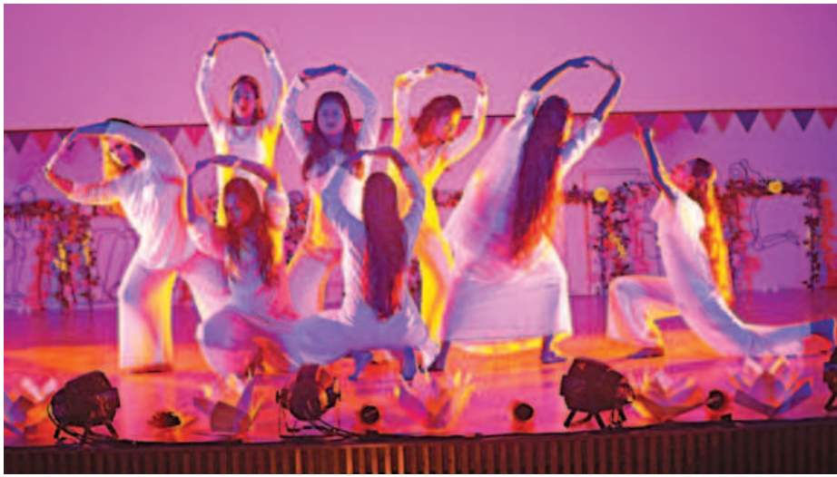
Artistes performing at the award ceremony.

Theatre troupe Prachyanaut performed at the event, where the awardees were given cash support of Tk 2 lakh each.