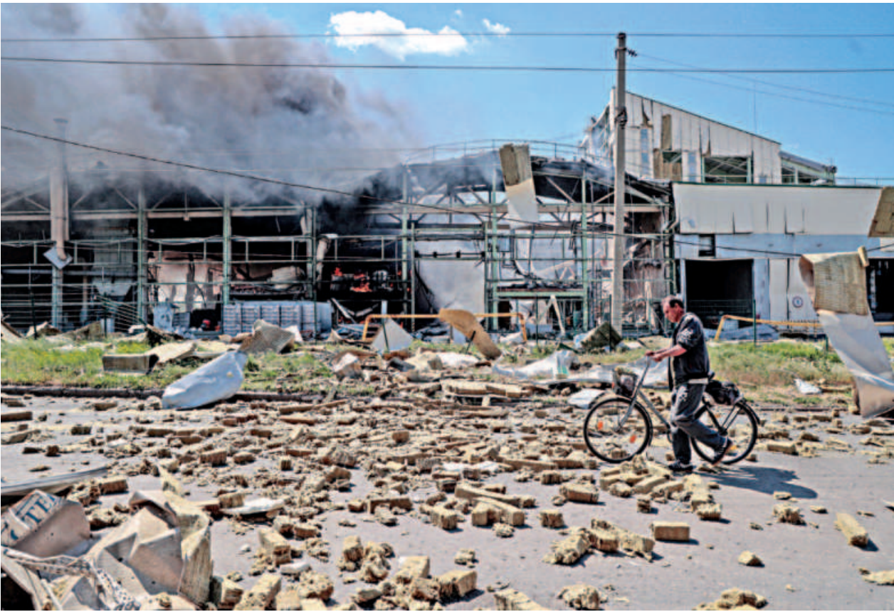
A local resident walks past an industrial building damaged by a Russian military strike in the town of Bakhmut, in Donetsk region, Ukraine, yesterday.

The Taliban yesterday rejected the UN Security Council's call to reverse heavy restrictions imposed on Afghan women, dismissing their concerns as "unfounded". The Security Council unanimously adopted a resolution on Tuesday that criticised the Taliban for limiting girls' and women's access to education, government jobs and freedom of movement since seizing power last year. Afghanistan's supreme leader Hibatullah Akhundzada has also ordered women to cover up -- including their faces -- when in public, triggering international outrage.