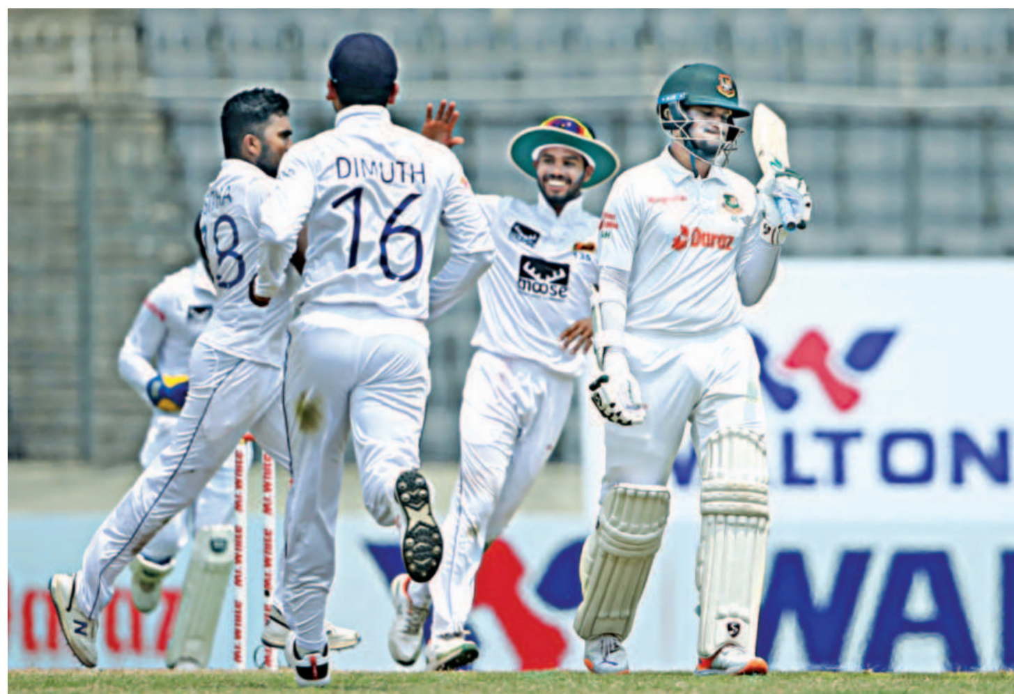
Bangladesh all-rounder Shakib Al Hasan (R) makes a despondent face as Sri Lanka players celebrate his dismissal during the fifth day of the second Test at the Sher-e-Bangla National Stadium in Mirpur yesterday.