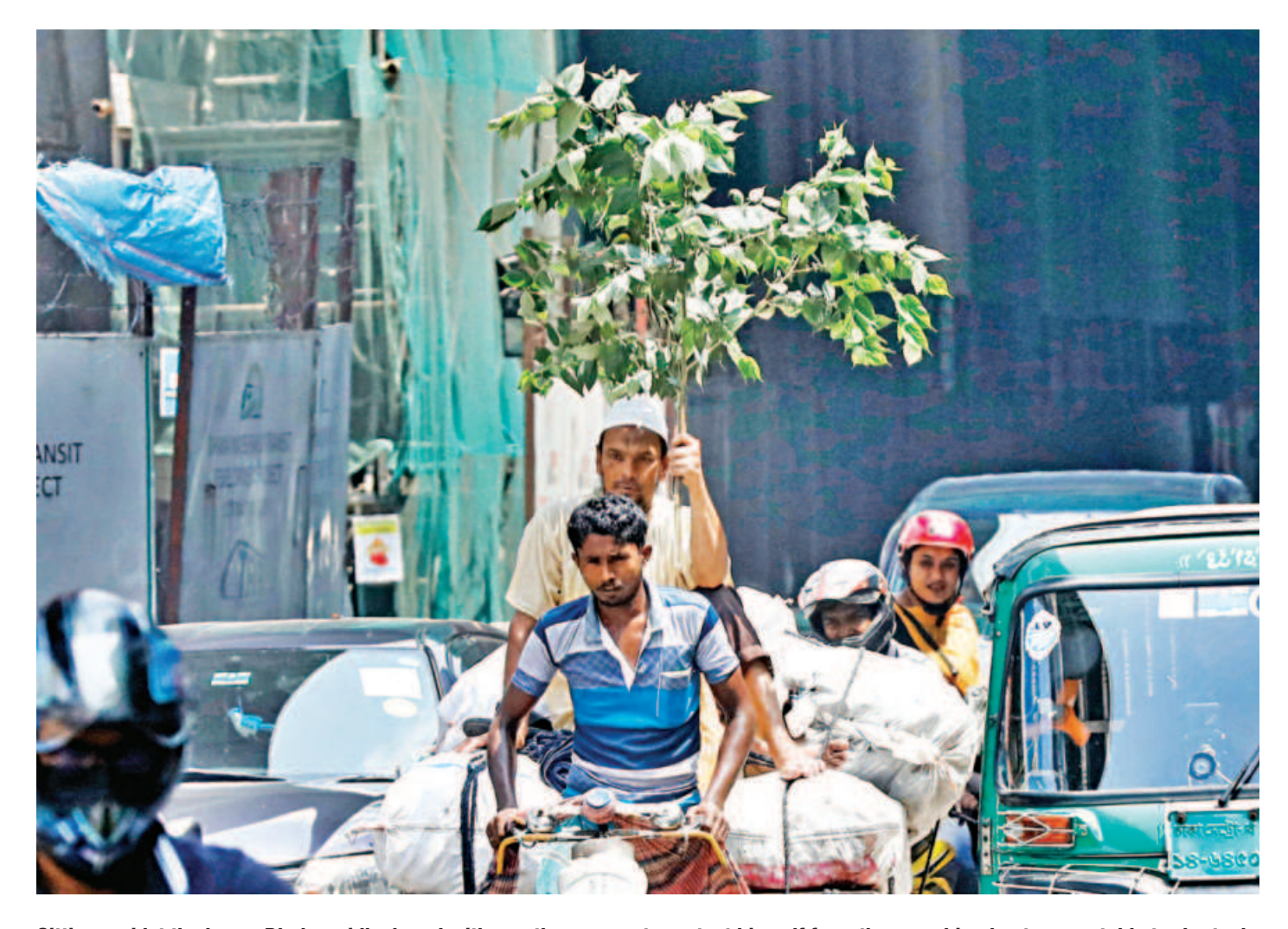
Sitting amidst the heavy Dhaka gridlock and with no other means to protect himself from the scorching heat, a vegetable trader took up an innovative solution -- using a branch of a tree he collected from the street to get some relief. This photo was taken in Kazi Nazrul Islam Avenue vesterdav.