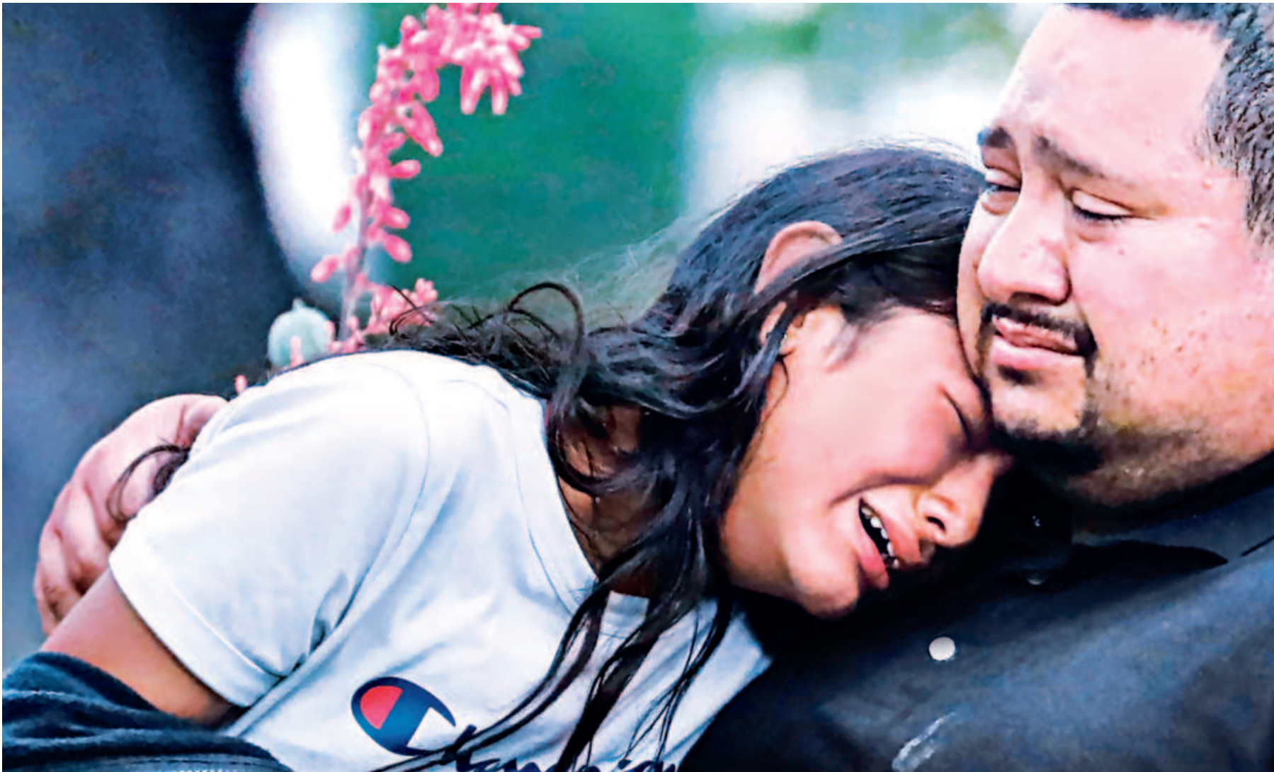
Relatives of a victim break down in tears after an 18-year-old gunman shot dead 19 children and two adults at the Robb Elementary School, in Uvalde, Texas, US, on Tuesday.