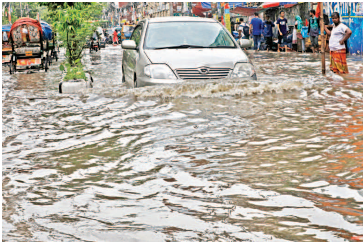
A car struggles to ply a waterlogged Green Road in the capital yesterday afternoon. While the sudden downpour may have brought relief from the unbearable heat to many across the city, others had to suffer while wading through knee-deep contaminated water in many areas.