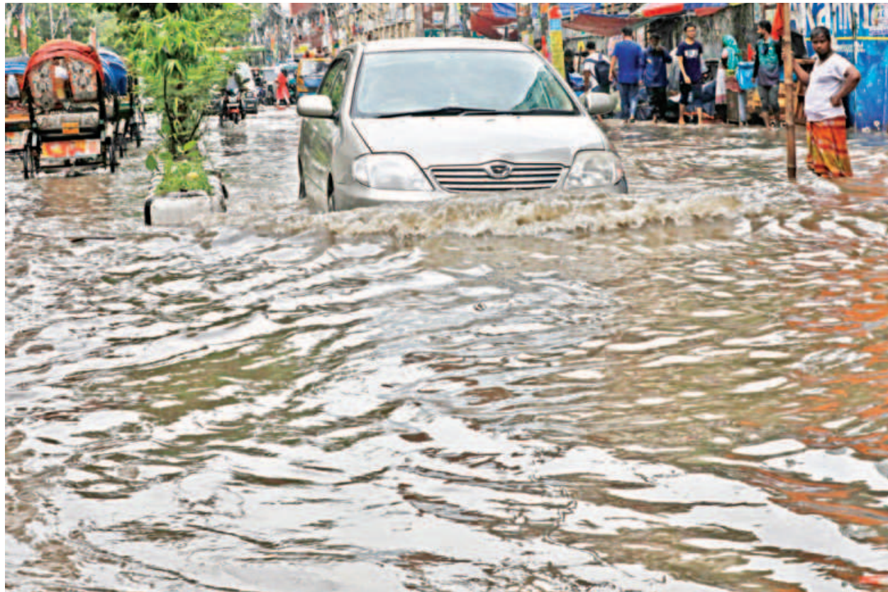
A car struggles to ply a waterlogged Green Road in the capital yesterday afternoon. While the sudden downpour may have brought relief from the unbearable heat to many across the city, others had to suffer while wading through knee-deep contaminated water in many areas.