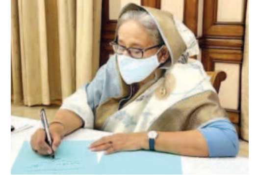
PM approving the inauguration date.

The double-decker bridge -- a four-lane road on top and broad-gauge single rail track on the bottom -- is expected to boost the country's gross domestic product by 1.2 percent.