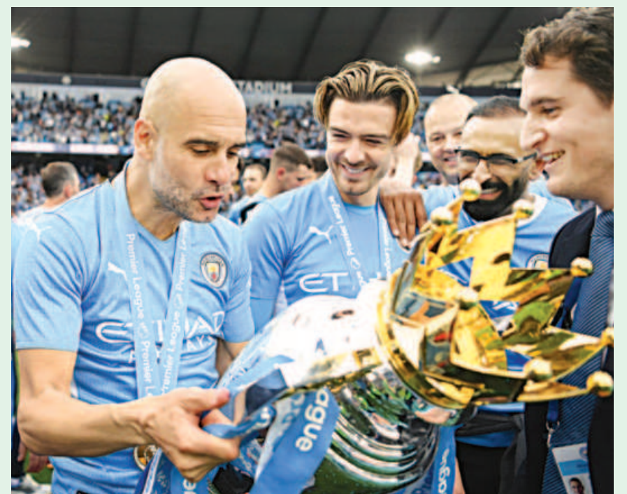
Spaniard Pep Guardiola became the most successful foreign manager in English football, in terms of league titles won, when he clinched his fourth Premier League crown on Sunday. With his latest success, the Manchester City manager moved above Frenchman Arsene Wenger and Portuguese Jose Mourinho who both have three Premier League titles to their names.

That heartache at the Bernabeu came a year after City's limp loss to Chelsea in their first ever Champions League final.