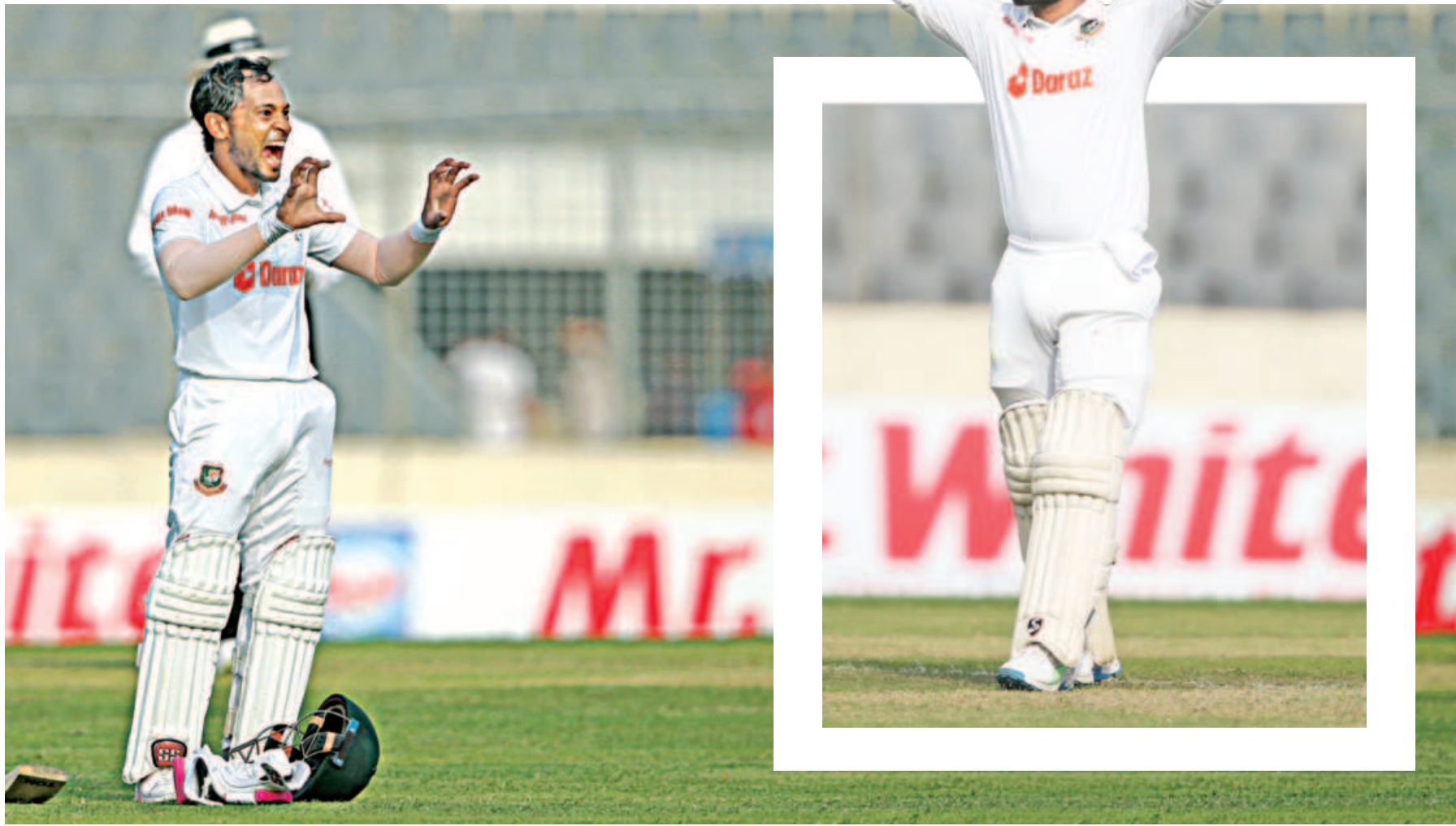
Mushfiqur Rahim animating a Tiger's roar is the apt depiction of how the opening day of Bangladesh's second Test against Sri Lanka went in Mirpur yesterday. Both Mushfiqur and Liton Das struck unbeaten tons and stitched together a record 253-run unbeaten sixth-wicket stand to help Bangladesh roar back into the Test.