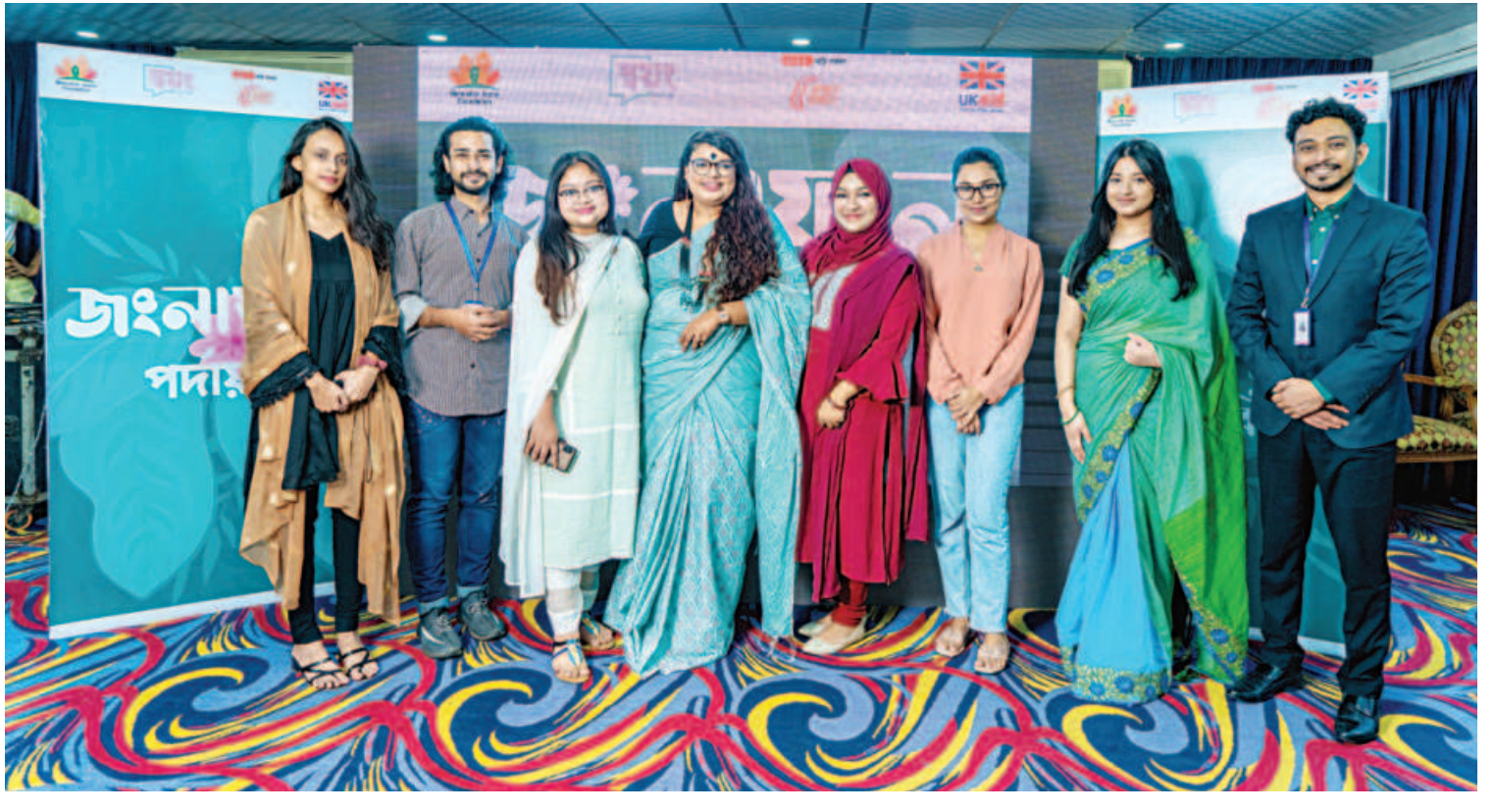
Swayong team members and guests at the screening of the documentary film.