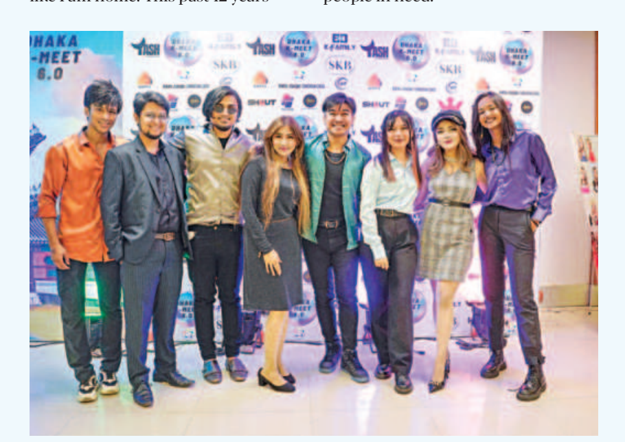
Participants and guests at the programme.

In 2023, Bangladesh and Korea will reach 50 years of diplomatic friendship, which is a big celebration of harmony. The community will promote peace and harmony between both nations. The events of BD K-Family are maintained by volunteers from Smile, a non-profit organisation and an amount from ticket sales will be donated to help people in need.